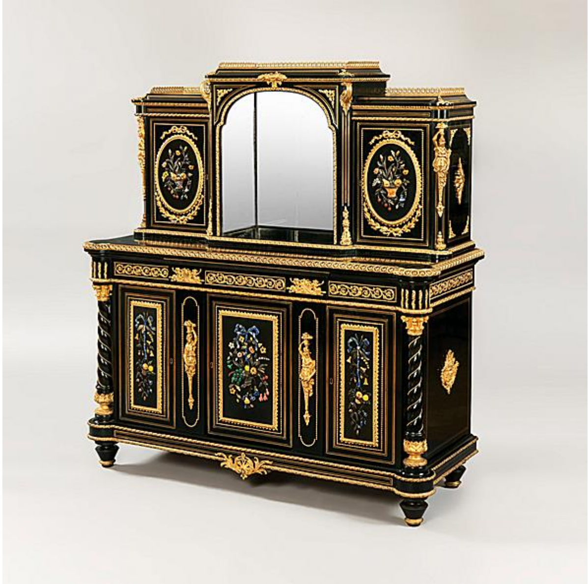
A SIDE CABINET OF THE FRENCH SECOND EMPIRE PERIOD IN THE MANNER OF BEFORT JEUNE

XVIII-XIX CENTURY FURNITURE & DECORATIVE ARTS