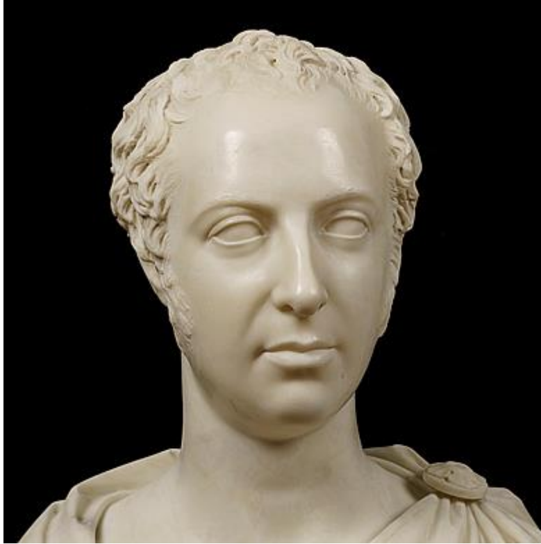
A Male Portrait Bust in the Roman Manner

XVIII-XIX CENTURY FURNITURE & DECORATIVE ARTS