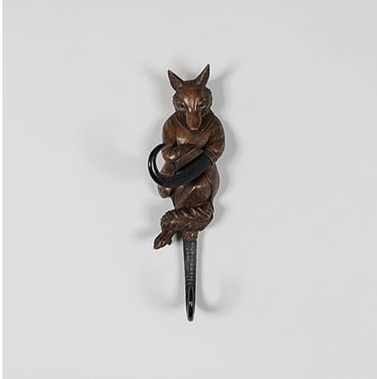
A Black Forest Coat Hook

XVIII-XIX CENTURY FURNITURE & DECORATIVE ARTS