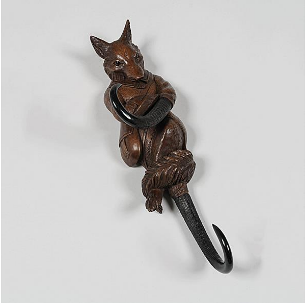
A BLACK FOREST WHIP HOOK

XVIII-XIX CENTURY FURNITURE & DECORATIVE ARTS