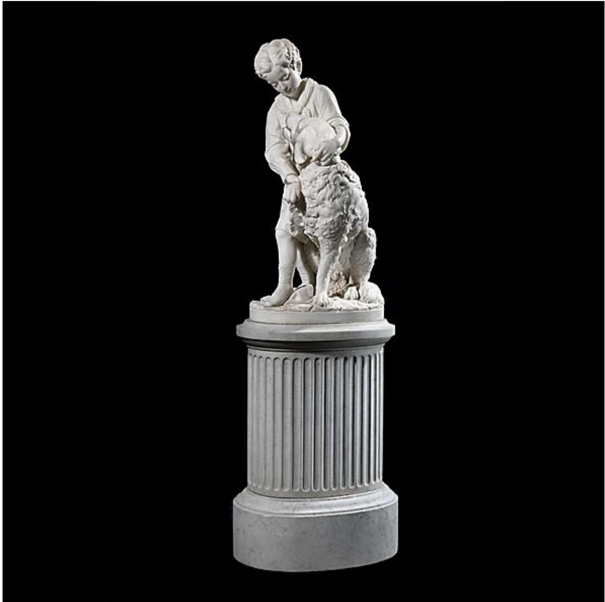
'BEST FRIENDS' BY ENRICO PAZZI

XVIII-XIX CENTURY FURNITURE & DECORATIVE ARTS