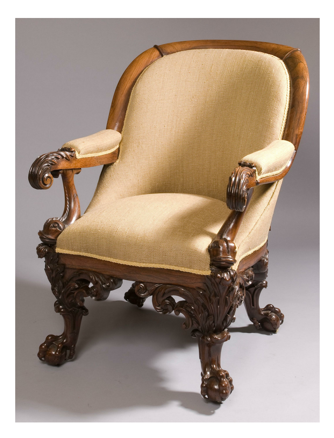
Ref. 5713, One of an Impressive Pair of Library Armchairs in the High Victorian Manner, circa 1850. Previously with Butchoff Antiques, London.

In the course of the 18th century, as European trade with Asia expanded greatly, so did the import of many Chinese and Japanese goods, such as porcelain and bronzes, displaying the ball and claw. The taste for the exotic was prevalent in the fine and decorative arts, and it was not long until the ball and claw foot appeared in English furniture.