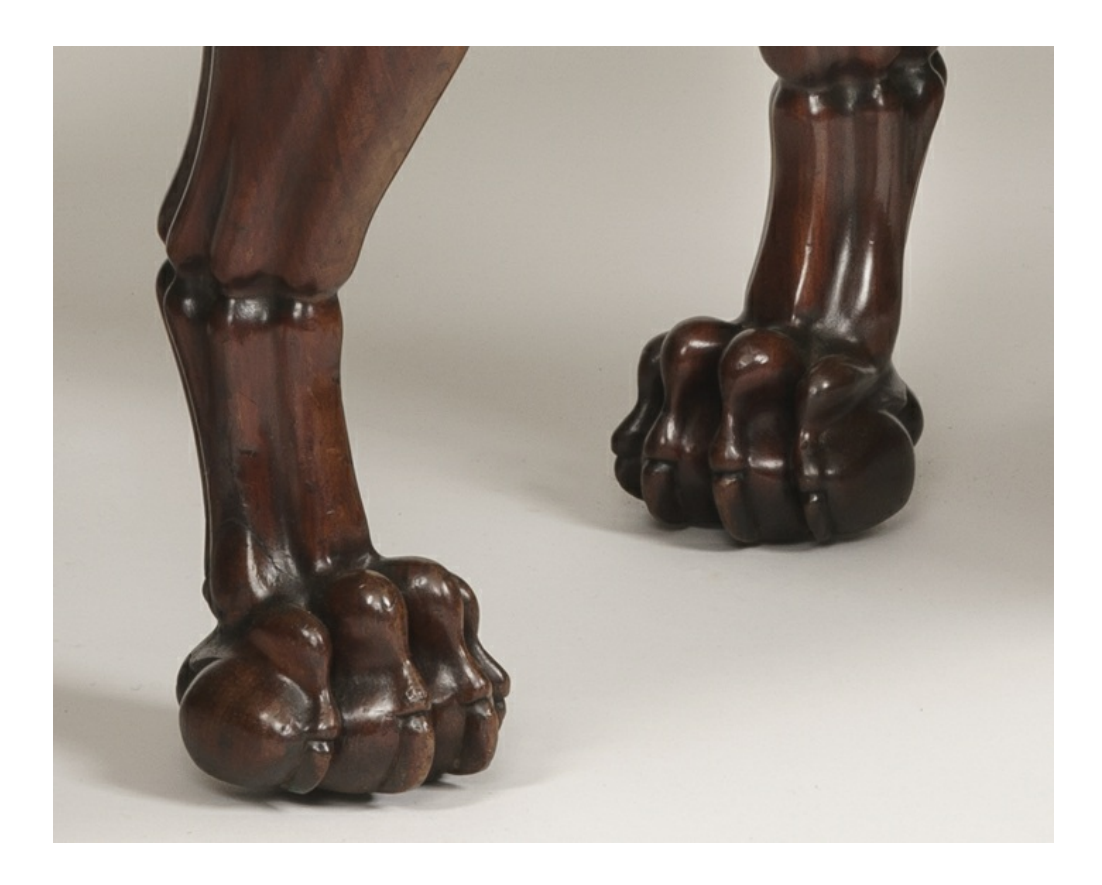
<u>Ref. 8568, A Pair of Armchairs (detail), stamped Veuve Meunier of Paris, circa 1850. Butchoff</u> <u>Antiques, London.</u>