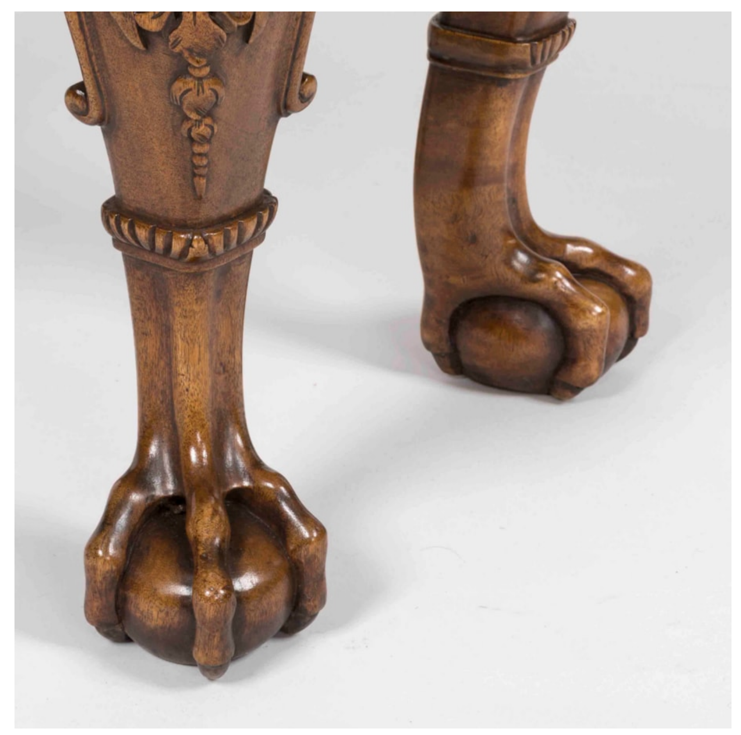
B is for Ball & Claw Foot

The ball & claw foot was introduced into the canon of Western furniture in the 18th-century, when furniture designers and makers started documenting, sharing, and exploring new aesthetic possibilities. Although traditionally associated with Chippendale furniture, the style of foot appeared already in the Queen Anne period (1702-1714).