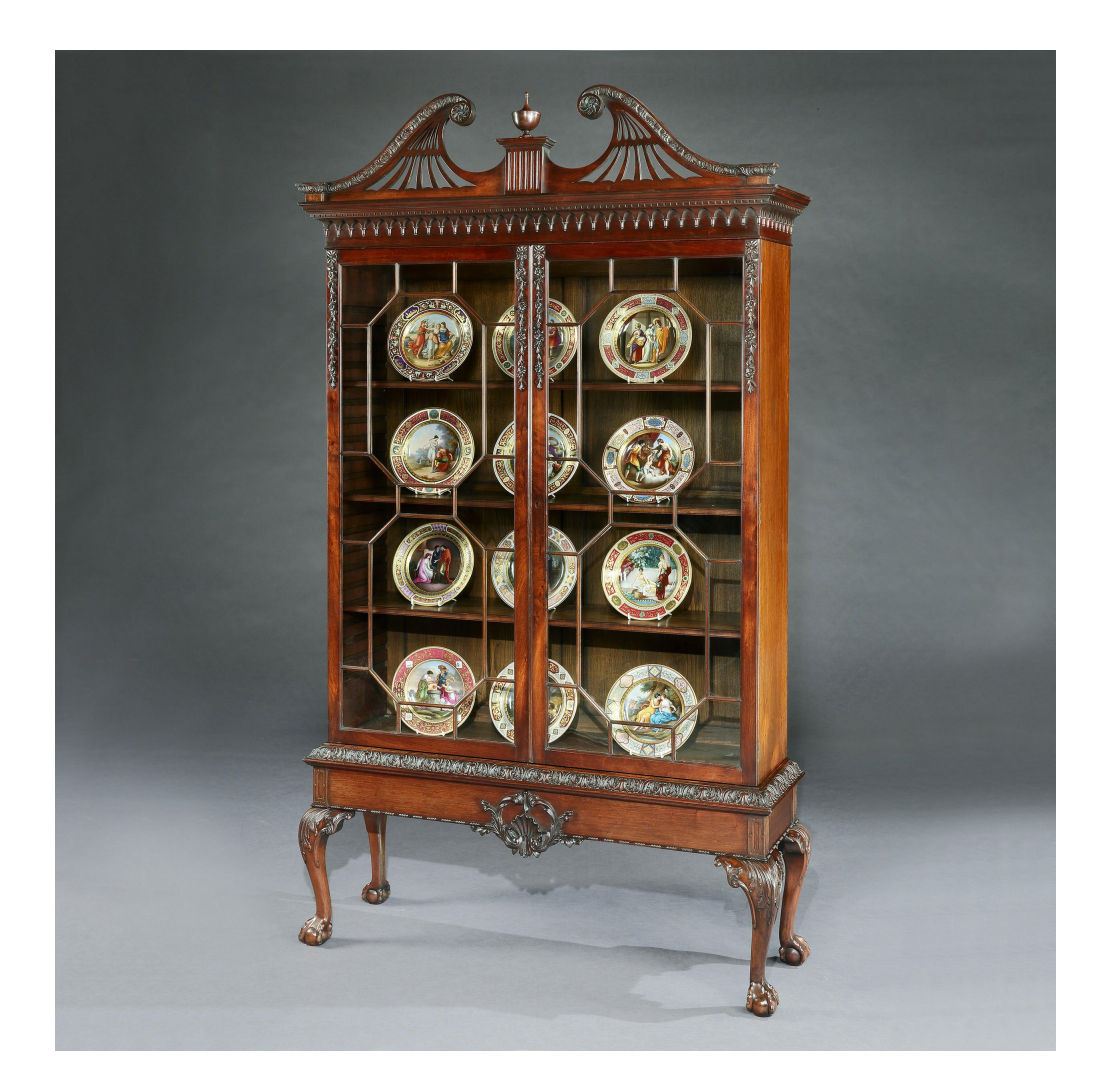
<u>Ref. 8493. A Display Cabinet in the manner of Thomas Chippendale, circa 1910. Butchoff</u> <u>Antiques, London.</u>

The curved legs associated with this style, called cabriole, often culminated in a literal foot. It is historically believed the design of the ball-and-claw originated in China. The claw represented by a dragon clutching a sacred jewel. According to Chinese mythology, the dragon (emperor) is guarding the jewel (the symbol of wisdom or purity) from wicked sources trying to steal it. This motif was also adopted by Japan.