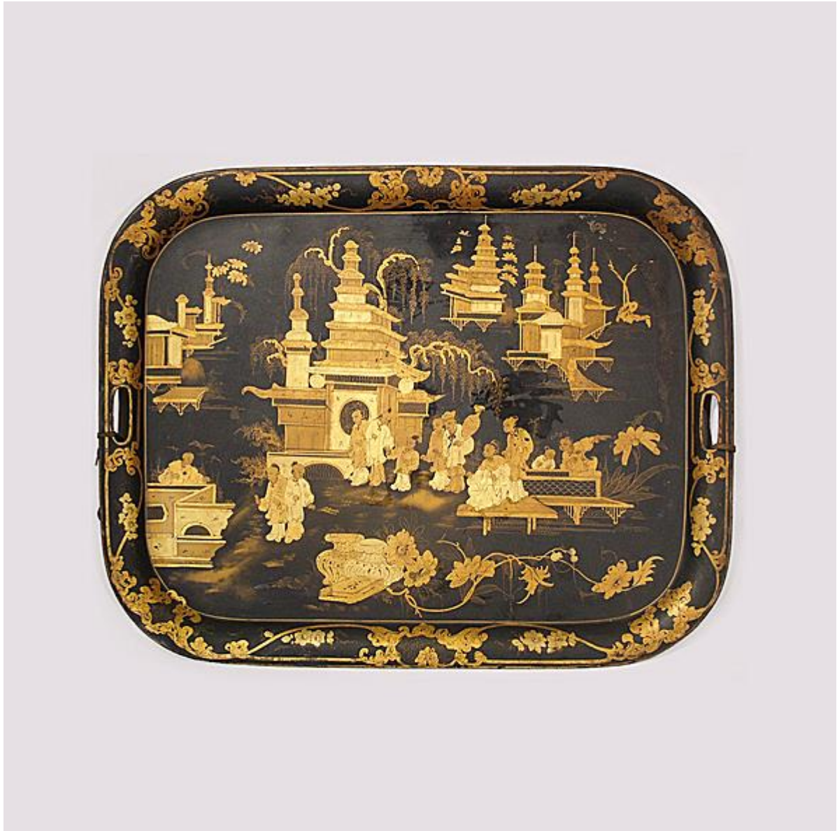
A PONTYPOOL TRAY OF THE REGENCY PERIOD

XVIII-XIX CENTURY FURNITURE & DECORATIVE ARTS