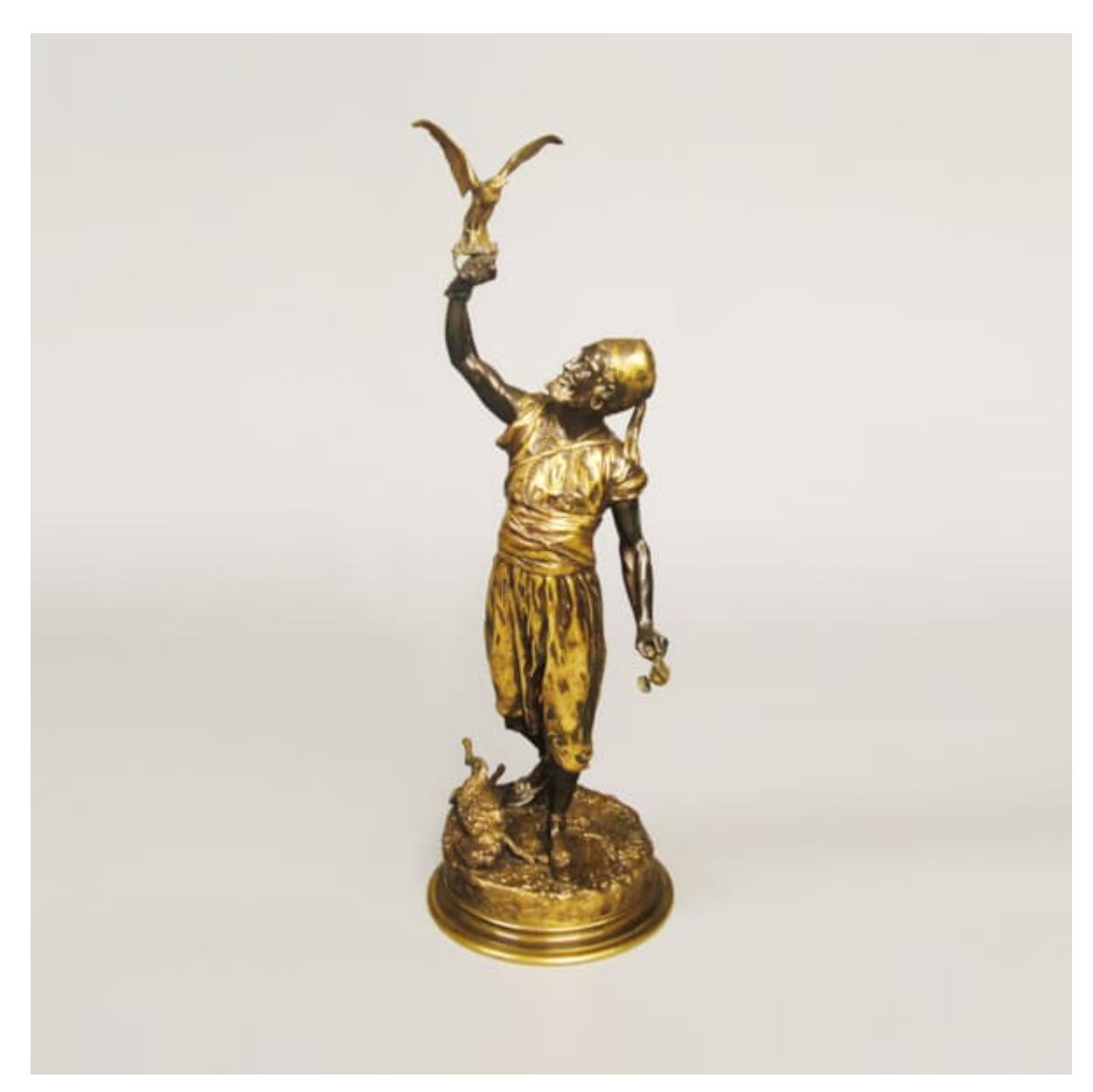
'THE ARAB FALCONER' BY PIERRE-JULES MENE