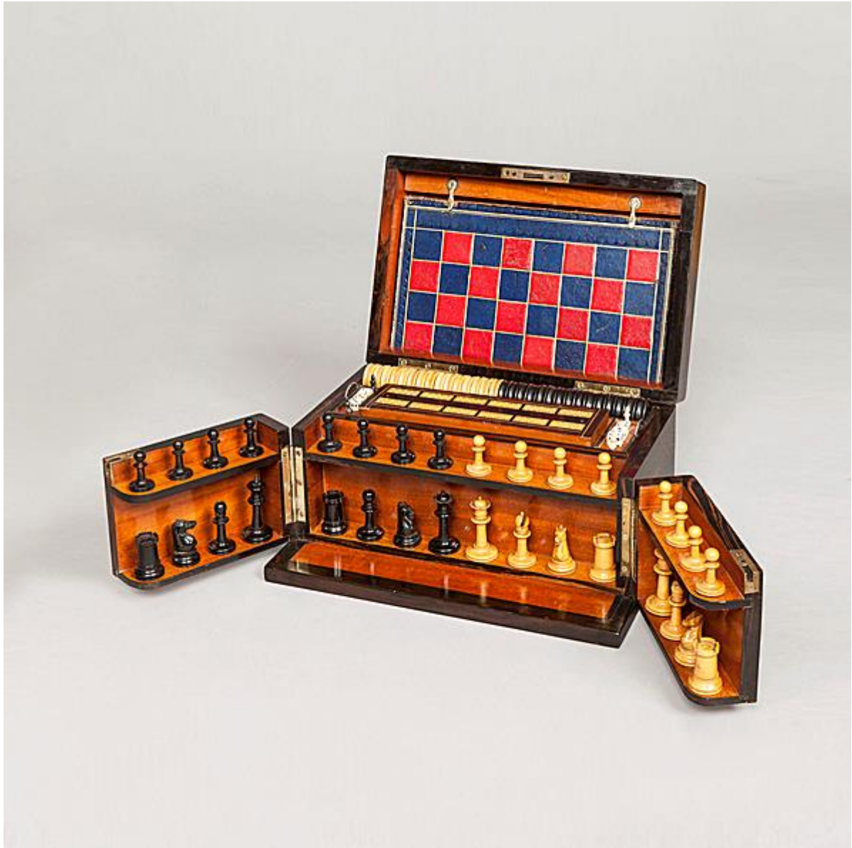
A CASED GAMES COMPENDIUM

XVIII-XIX CENTURY FURNITURE & DECORATIVE ARTS