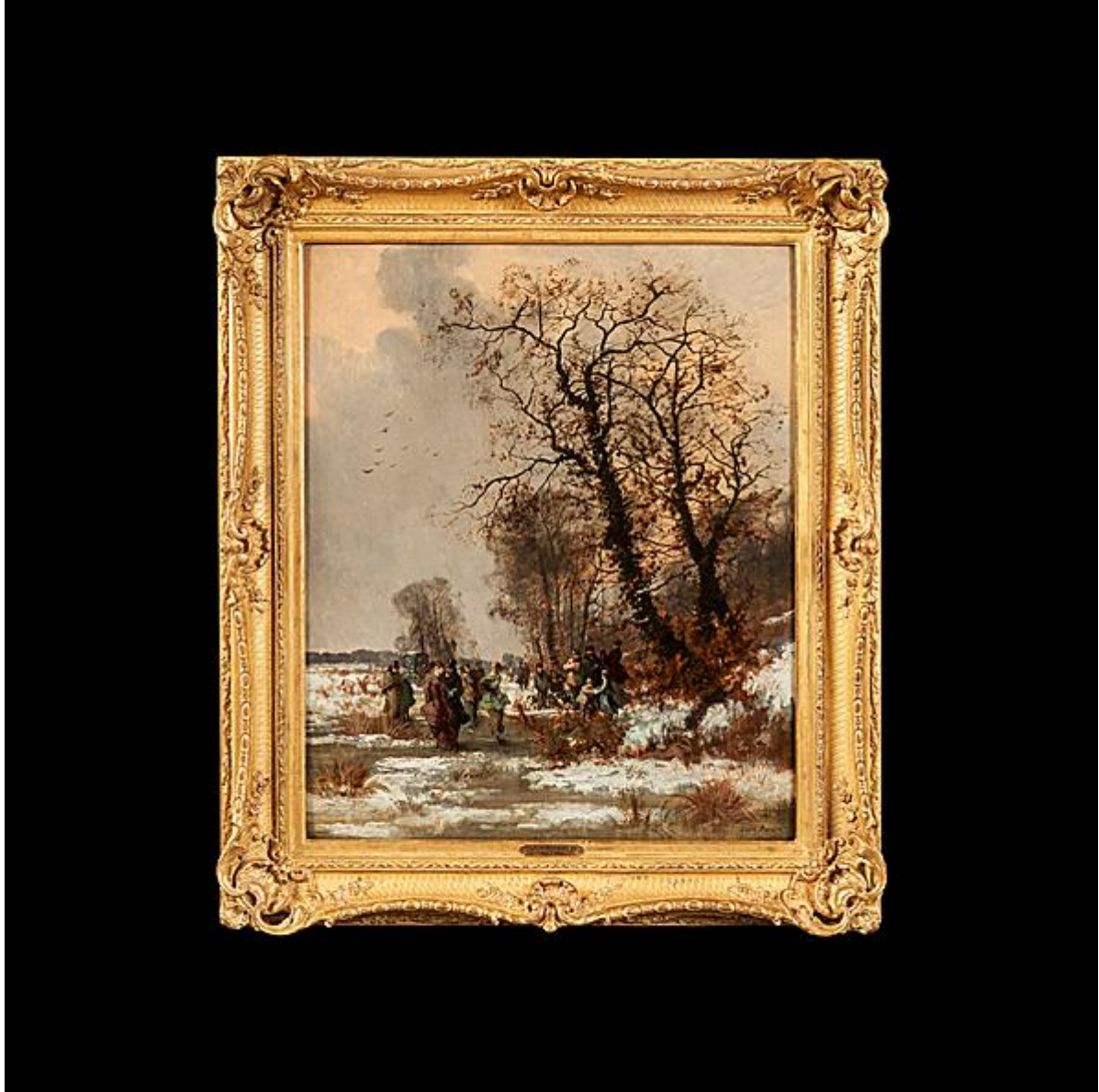
'THE SKATING PARTY' BY LOUIS BÉROUD

XVIII-XIX CENTURY FURNITURE & DECORATIVE ARTS