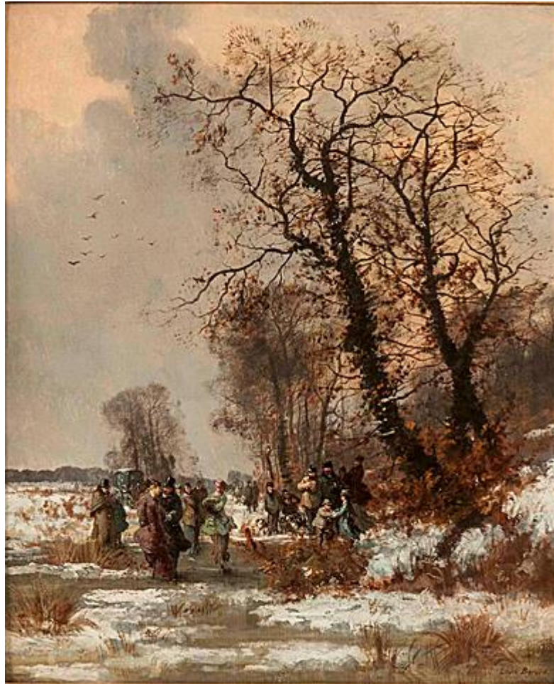
'The Skating Party' By Louis Béroud

XVIII-XIX CENTURY FURNITURE & DECORATIVE ARTS