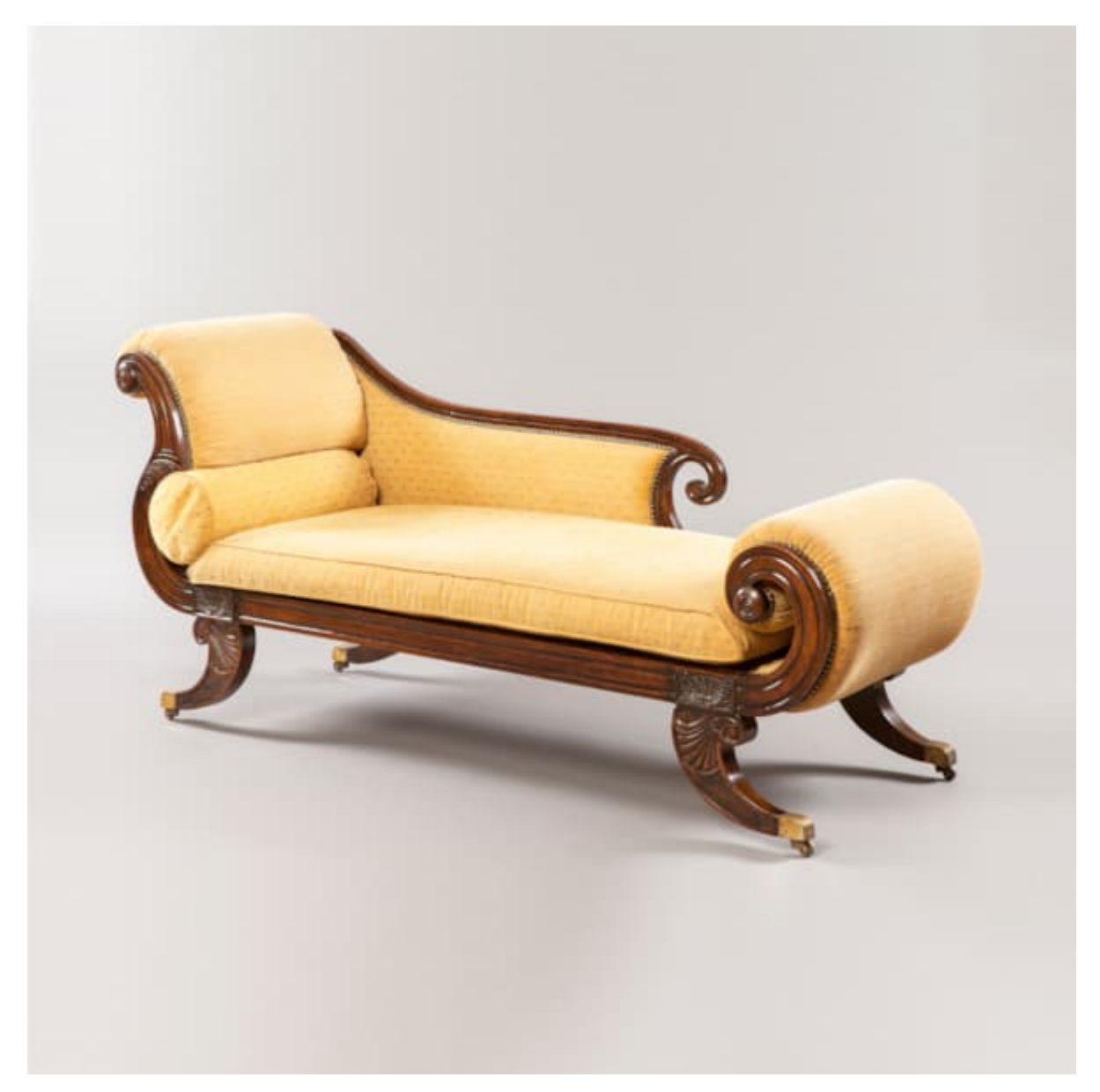
AN ELEGANT REGENCY PERIOD CHAISE LONGUE

Dimensions: H: 35 in / 89 cm | L: 74 in / 187 cm | D: 25 in / 64 cm