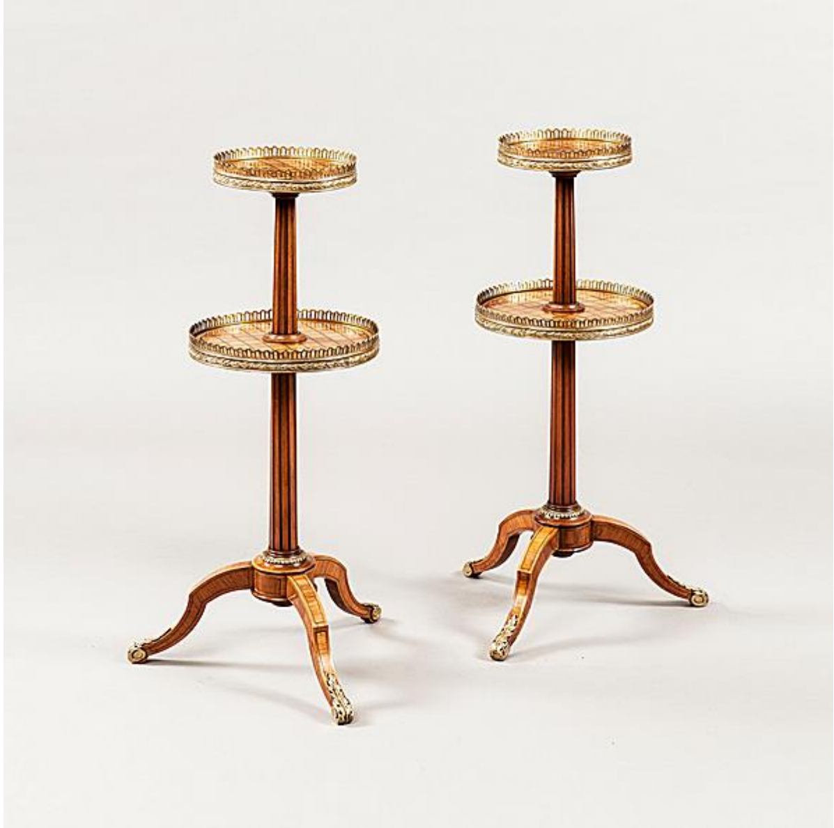
A PAIR OF ÉTAGÈRES

XVIII-XIX CENTURY FURNITURE & DECORATIVE ARTS