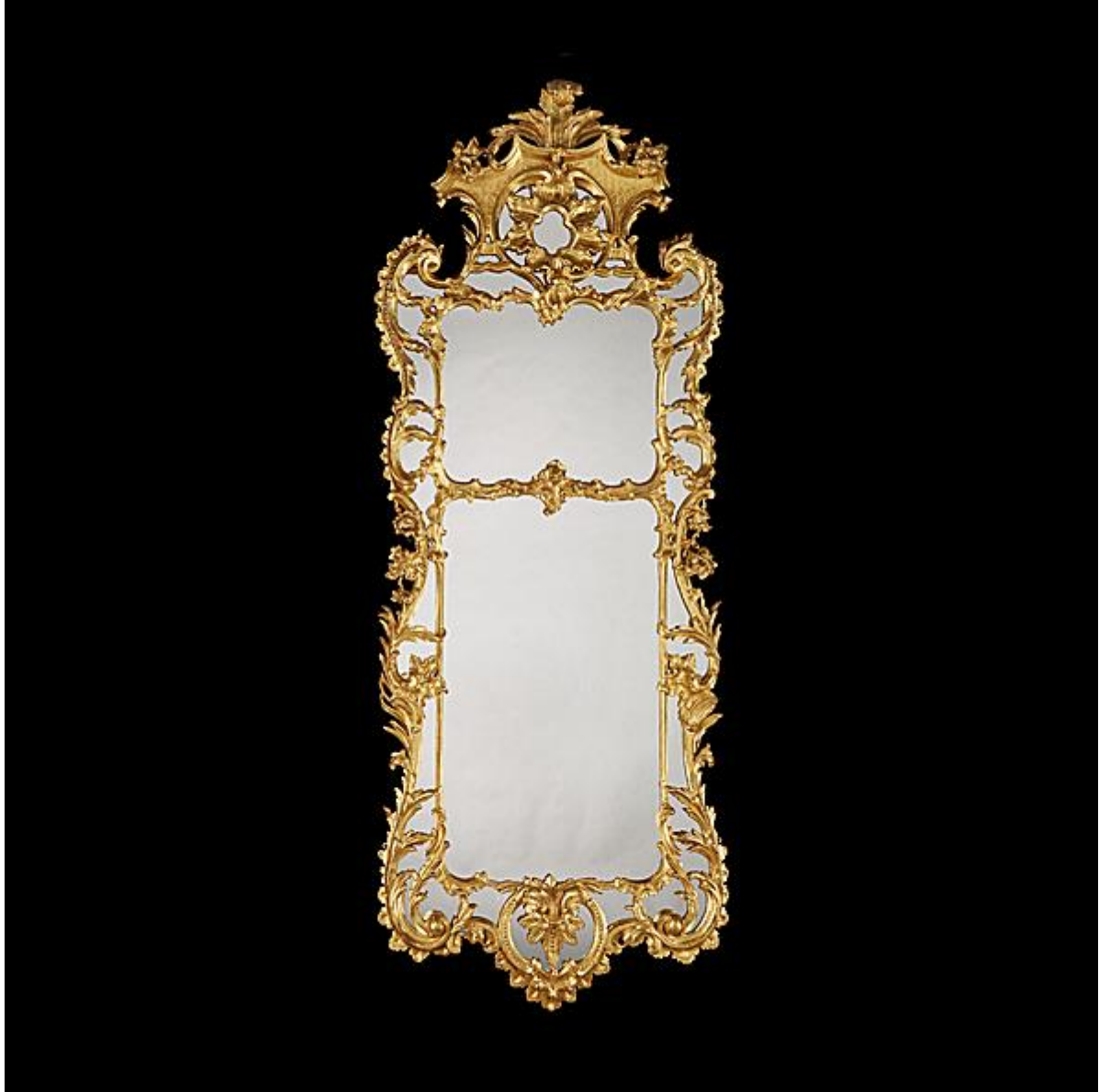
A GILTWOOD MIRROR IN THE MID-EIGHTEENTH CENTURY MANNER

XVIII-XIX CENTURY FURNITURE & DECORATIVE ARTS