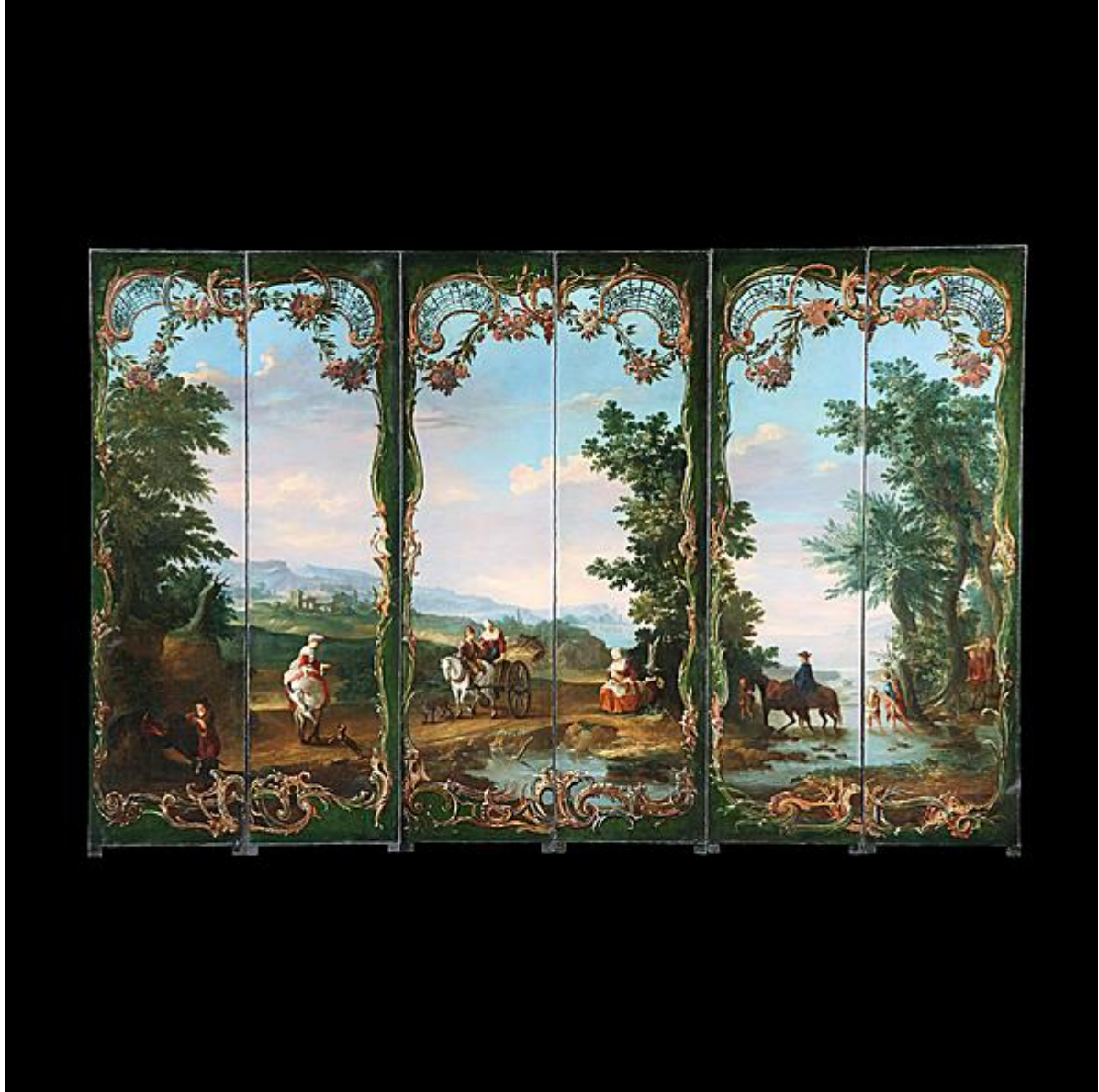
A SIX PANELLED SCREEN OF THE LATE BAROQUE PERIOD

XVIII-XIX CENTURY FURNITURE & DECORATIVE ARTS