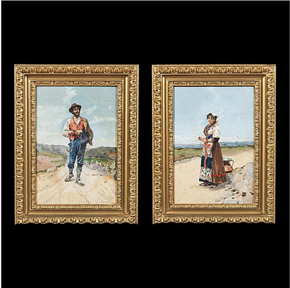
AN IMPORTANT PAIR OF LARGE MICROMOSAIC PLAQUES FROM THE VATICAN STUDIOS OF ROME

XVIII-XIX CENTURY FURNITURE & DECORATIVE ARTS