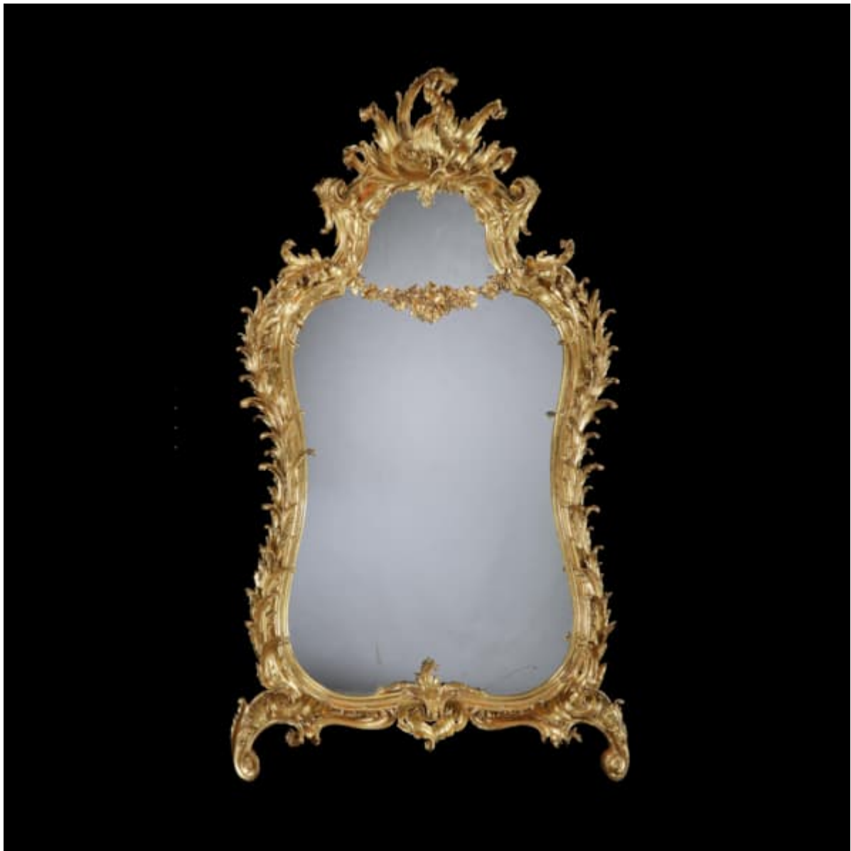
A GILTWOOD MIRROR IN THE MANNER OF THOMAS CHIPPENDALE

Dimensions: H: 101.25 in / 257 cm | W: 58.75 in / 149 cm | D: 11.5 in / 29 cm