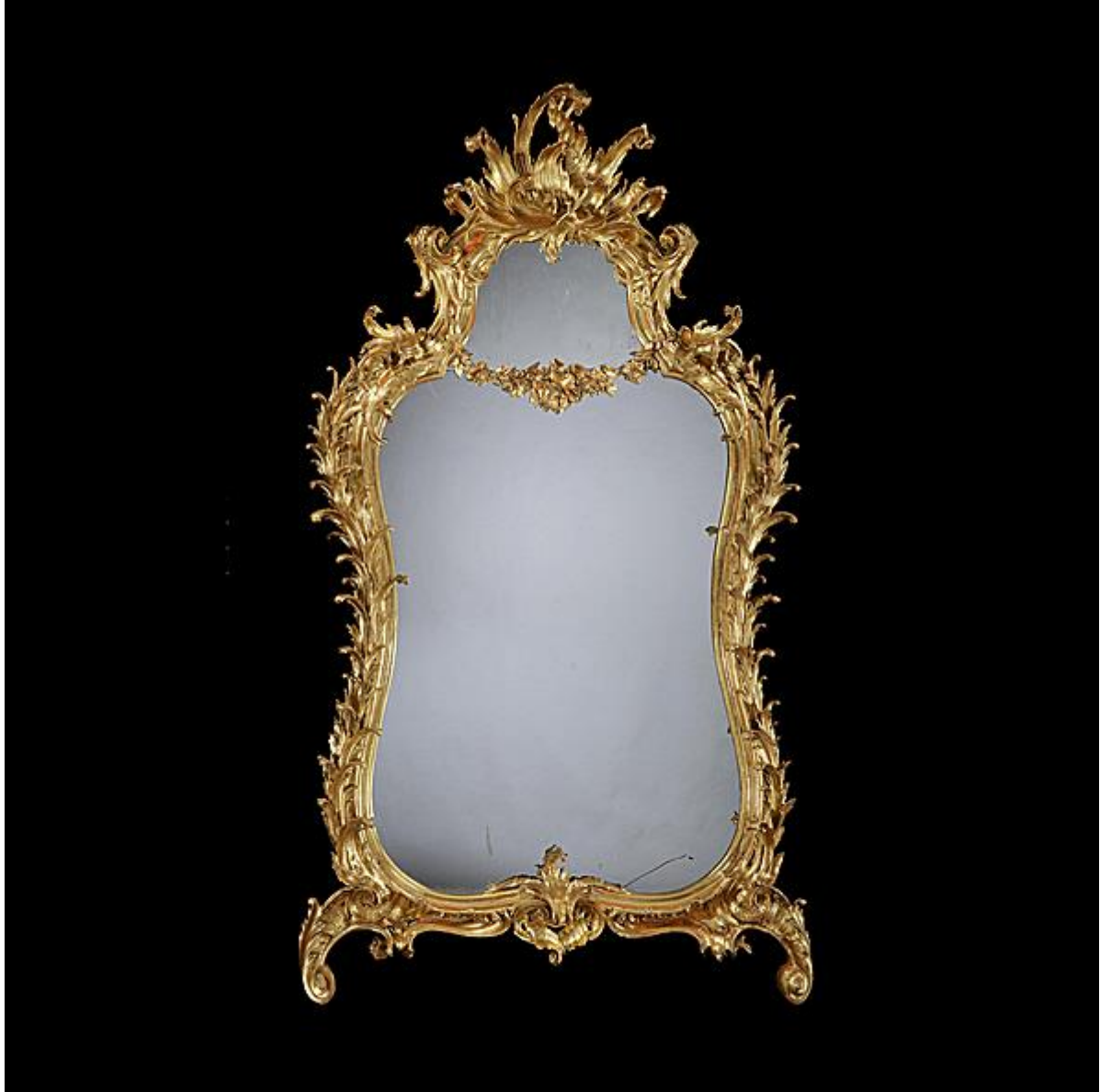
A GILTWOOD MIRROR IN THE MANNER OF THOMAS CHIPPENDALE

XVIII-XIX CENTURY FURNITURE & DECORATIVE ARTS