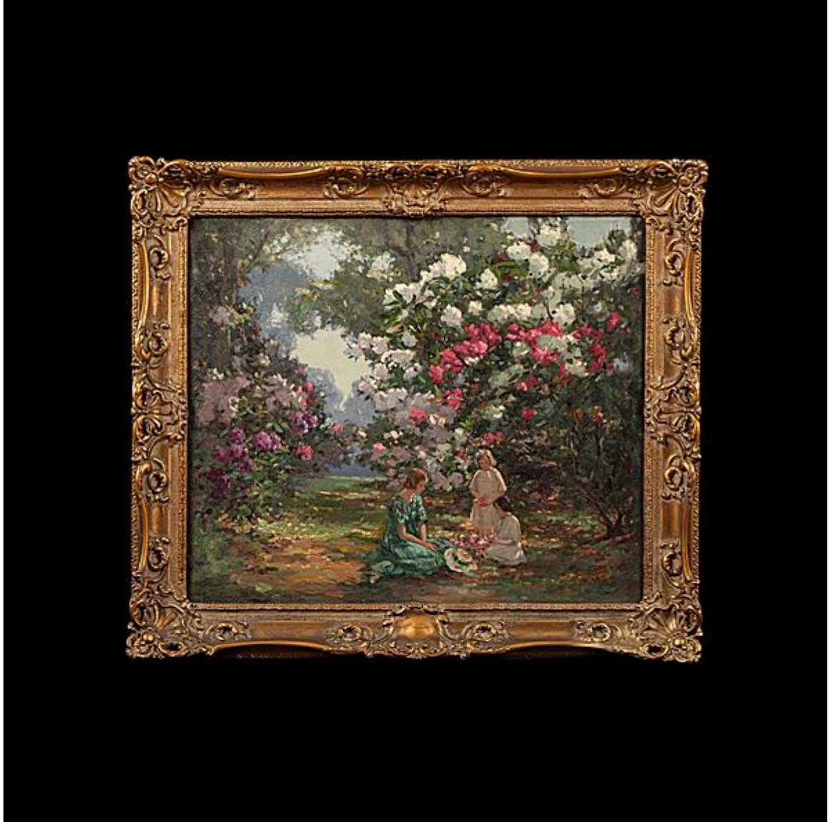
'KEW GARDENS' BY AUGUSTUS W. ENNESS

XVIII-XIX CENTURY FURNITURE & DECORATIVE ARTS