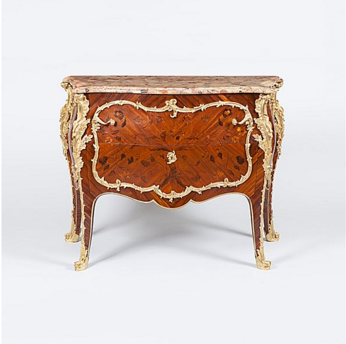
A FINE COMMODE IN THE LOUIS XV MANNER

XVIII-XIX CENTURY FURNITURE & DECORATIVE ARTS