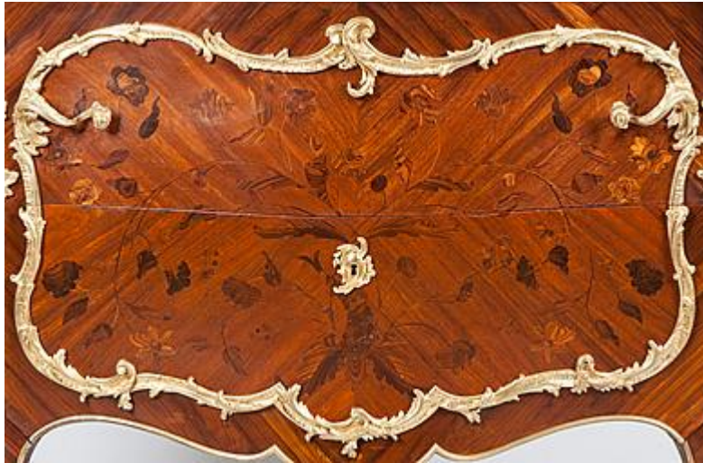
A Fine Commode in the Louis XV Manner after a model by Jacques Dubois By Maison Rogié of Paris

XVIII-XIX CENTURY FURNITURE & DECORATIVE ARTS