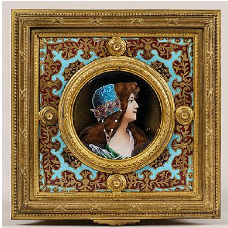
A French Jewellery Casket

XVIII-XIX CENTURY FURNITURE & DECORATIVE ARTS