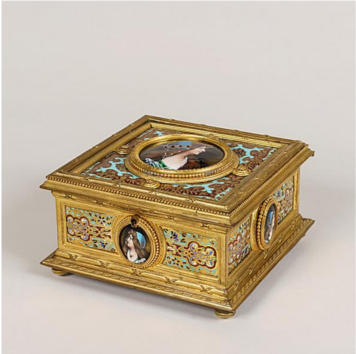
A FRENCH JEWELLERY CASKET

XVIII-XIX CENTURY FURNITURE & DECORATIVE ARTS