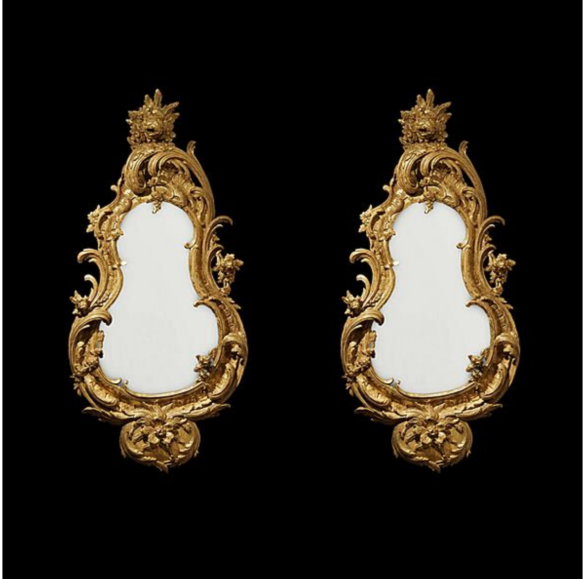
A PAIR OF GEORGE II STYLE MIRRORS

XVIII-XIX CENTURY FURNITURE & DECORATIVE ARTS