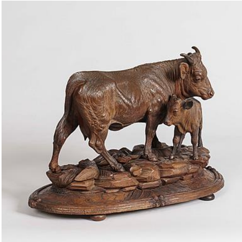
A Pair of Black Forest Cattle Attributed to Johann Huggler

XVIII-XIX CENTURY FURNITURE & DECORATIVE ARTS