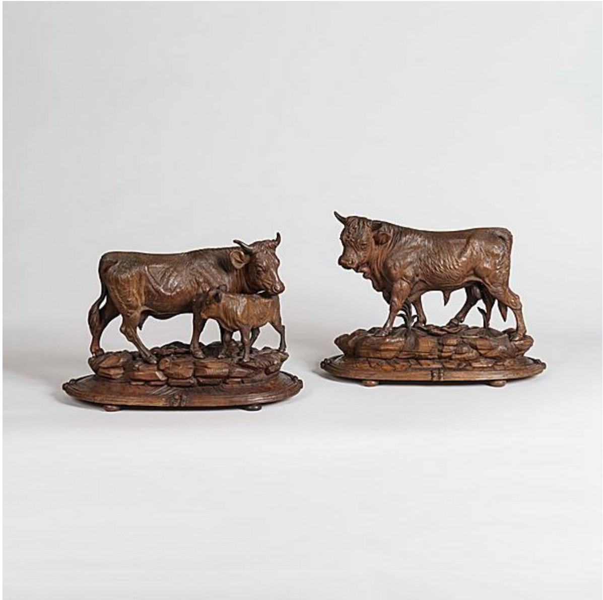
A PAIR OF BLACKFOREST CATTLE ATTRIBUTED TO JOHANN HUGGLER

XVIII-XIX CENTURY FURNITURE & DECORATIVE ARTS