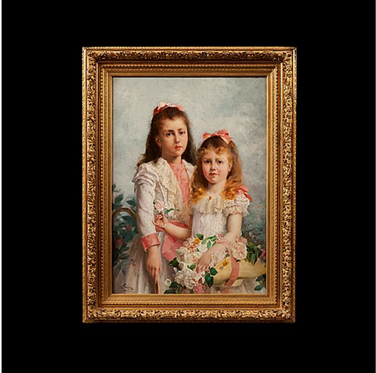
'THE SISTERS' BY LOUIS ADOLPHE TESSIER

XVIII-XIX CENTURY FURNITURE & DECORATIVE ARTS