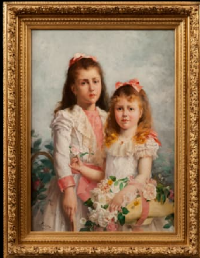
'THE SISTERS' BY LOUIS ADOLPHE TESSIER

Sight size: H: 35 in / 88 cm W: 25 in / 63 cm