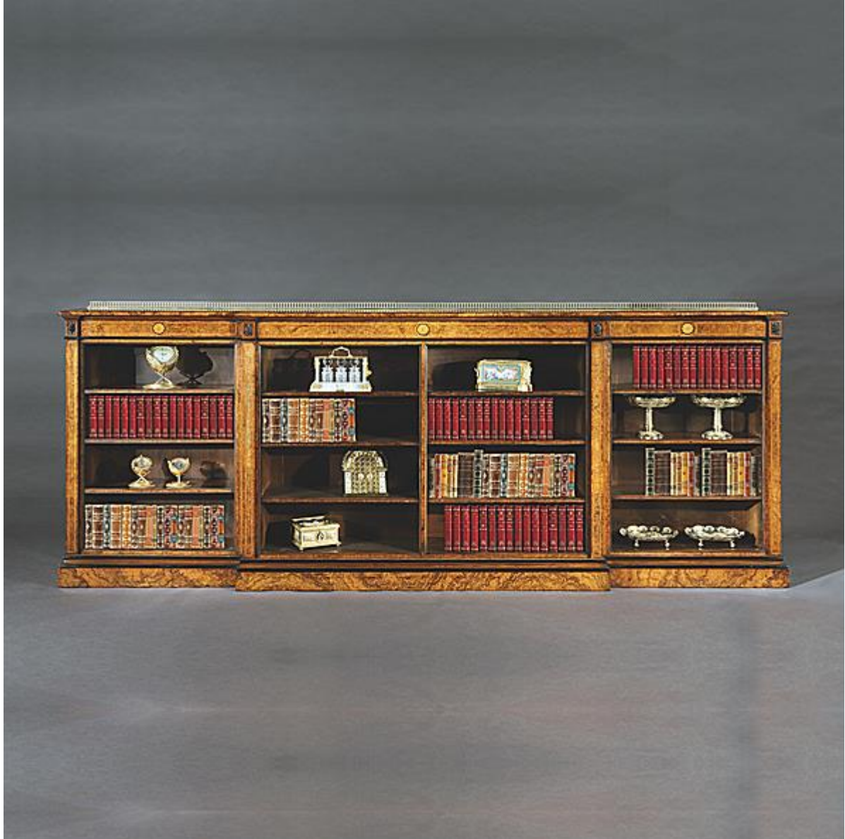
A SUBSTANTIAL WALNUT LIBRARY BOOKCASE

XVIII-XIX CENTURY FURNITURE & DECORATIVE ARTS