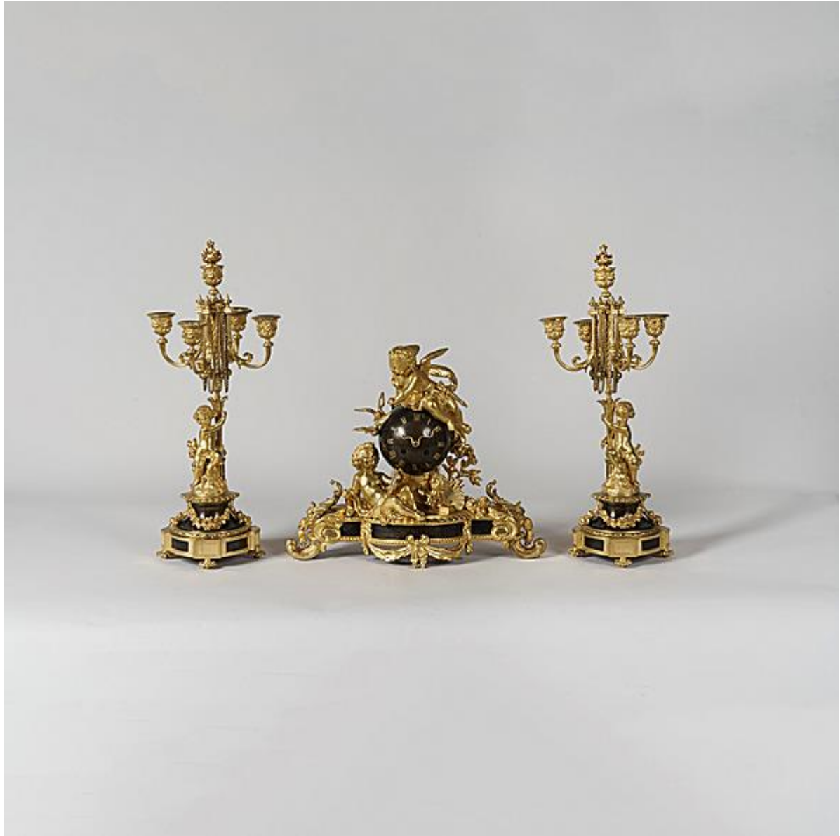
A NAPOLEON III GARNITURE DE CHÉMINÉE BY HENRI PICARD

XVIII-XIX CENTURY FURNITURE & DECORATIVE ARTS