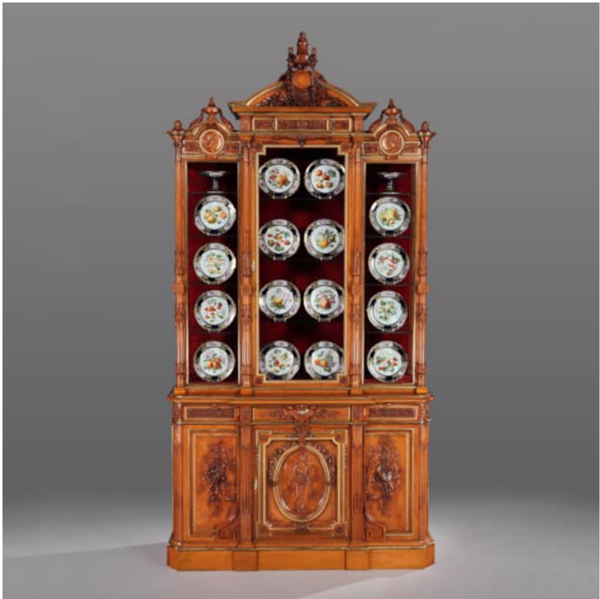
AN EXHIBITION-QUALITY CABINET BY MAISON GUÉRET OF PARIS

Dimensions: H: 119.5 in / 304 cm | W: 61 in / 155 cm | D: 19.5 in / 49 cm