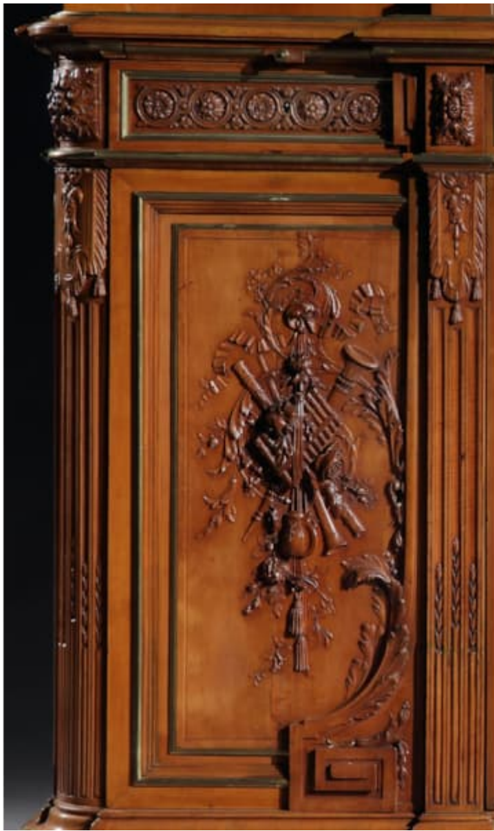
An Important Napoleon III Exhibition-Quality Ormolu-Mounted Carved Cabinet By Maison Guéret of Paris

Click below to see the complete documentation