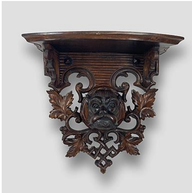
A Pair of Carved Lindenwood Wall Étagères from the Black Forest

XVIII-XIX CENTURY FURNITURE & DECORATIVE ARTS