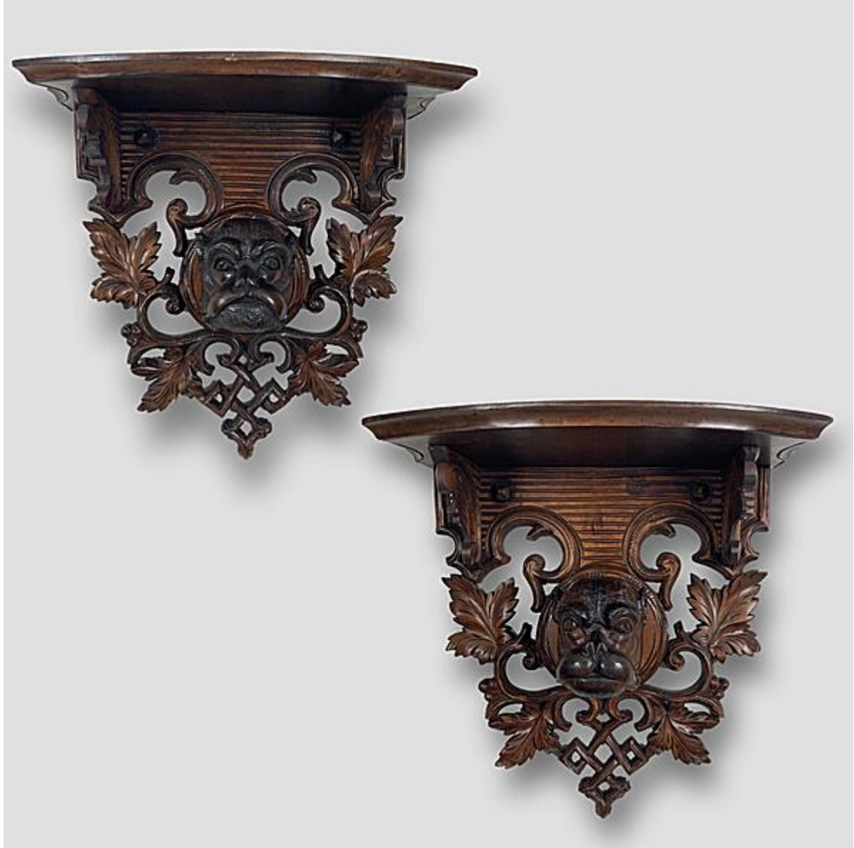
A PAIR OF CARVED WALL ÉTAGÈRES FROM THE BLACK FOREST

XVIII-XIX CENTURY FURNITURE & DECORATIVE ARTS