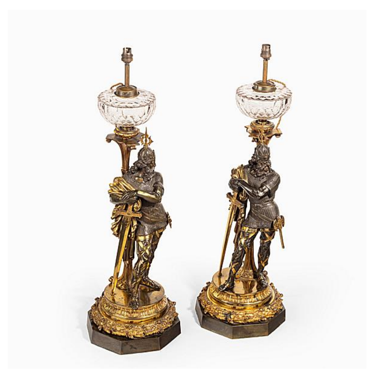
A PAIR OF PATINATED AND GILT BRONZE FIGURAL LAMPS