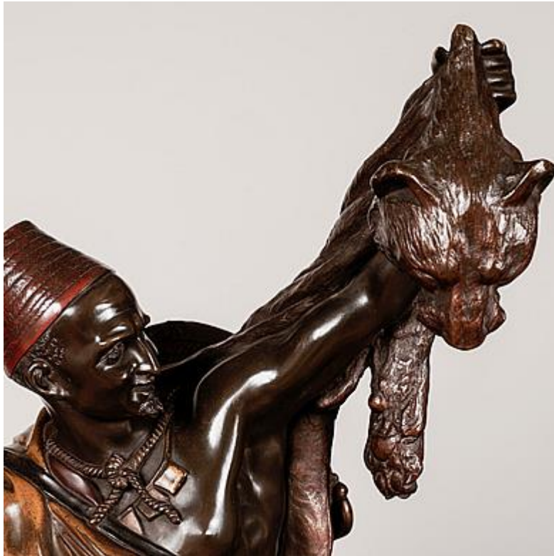
Kabyle au retour de la chasse By Arthur Waagen

XVIII-XIX CENTURY FURNITURE & DECORATIVE ARTS