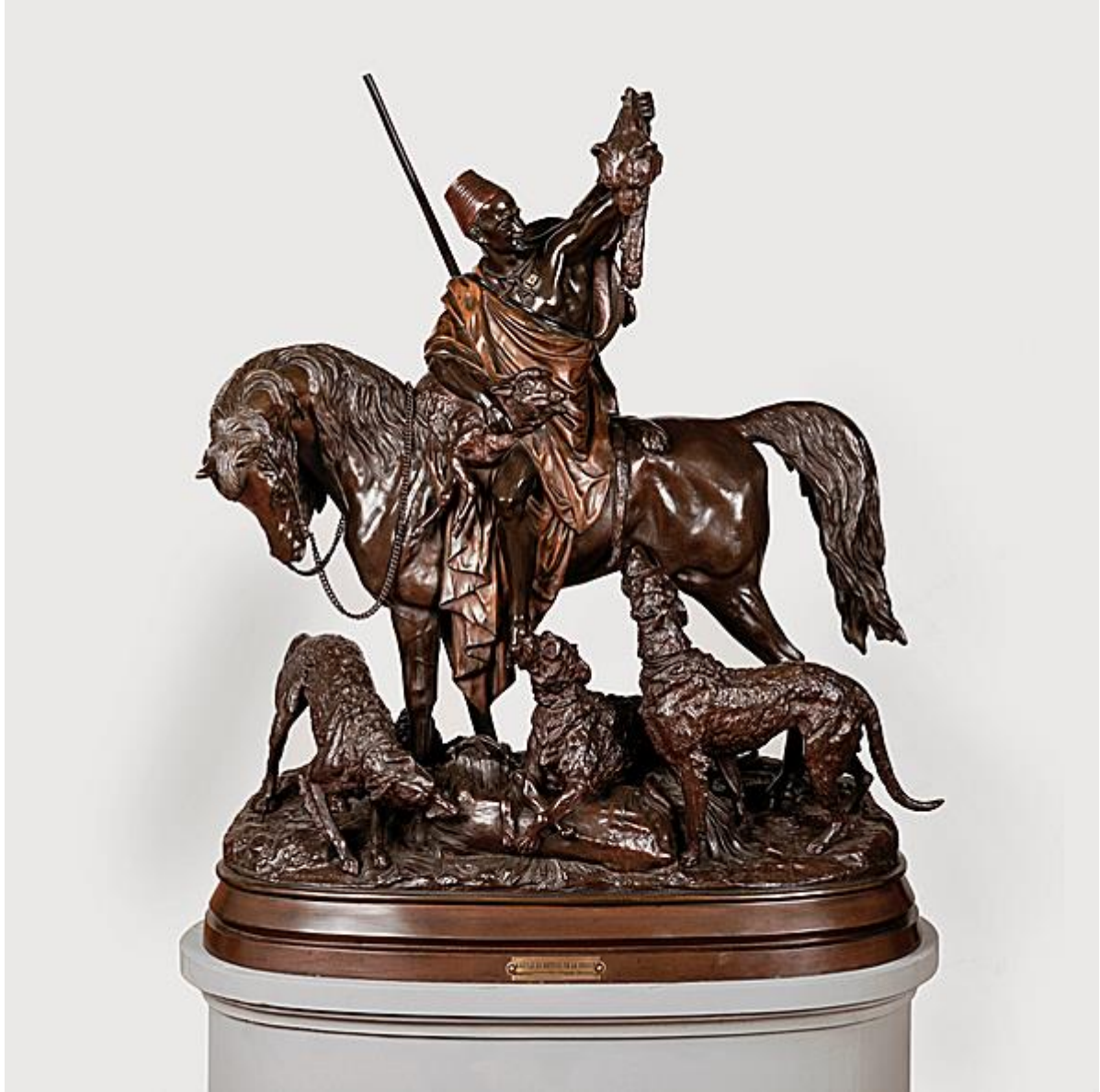
KABYLE AU RETOUR DE LA CHASSE BY ARTHUR WAAGEN

XVIII-XIX CENTURY FURNITURE & DECORATIVE ARTS