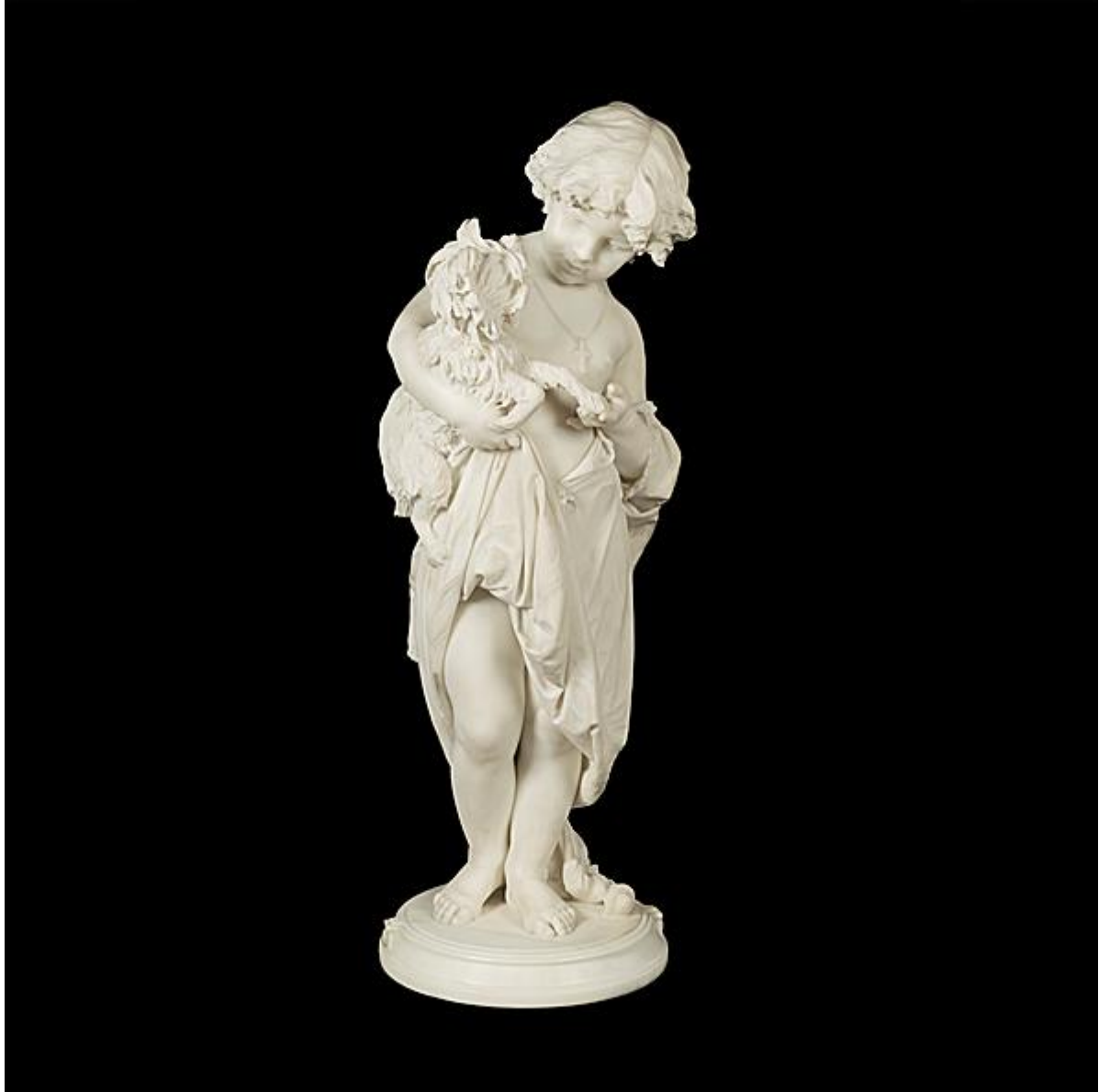
IL PRIMO AMIGO BY FRANCESCO BARZAGHI

XVIII-XIX CENTURY FURNITURE & DECORATIVE ARTS