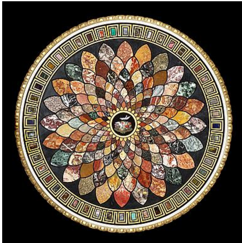
A Magnificent Centre Table signed by the makers Taprell, Holland & Son of London

XVIII-XIX CENTURY FURNITURE & DECORATIVE ARTS