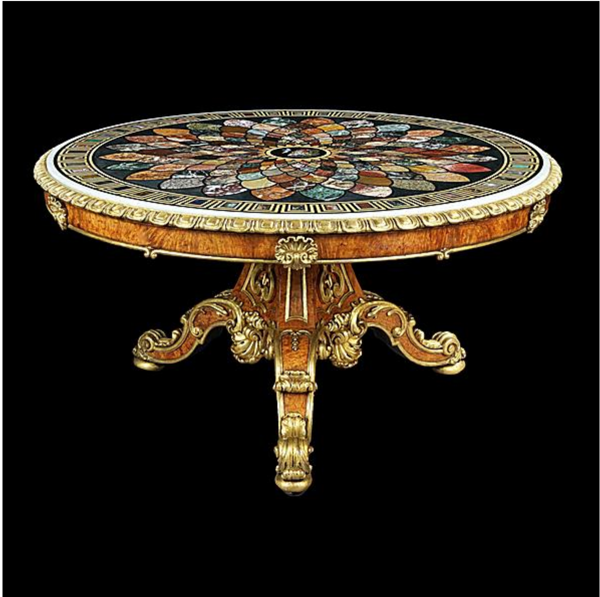
CENTRE TABLE BY TAPRELL, HOLLAND & SON

XVIII-XIX CENTURY FURNITURE & DECORATIVE ARTS