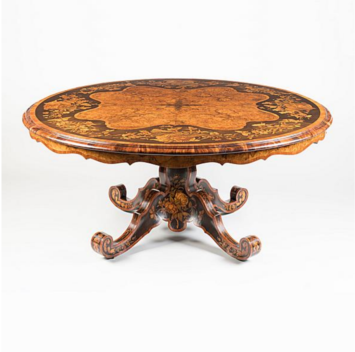
AN EXHIBITION-QUALITY BURR WALNUT AND MARQUETRY CENTRE TABLE

XVIII-XIX CENTURY FURNITURE & DECORATIVE ARTS