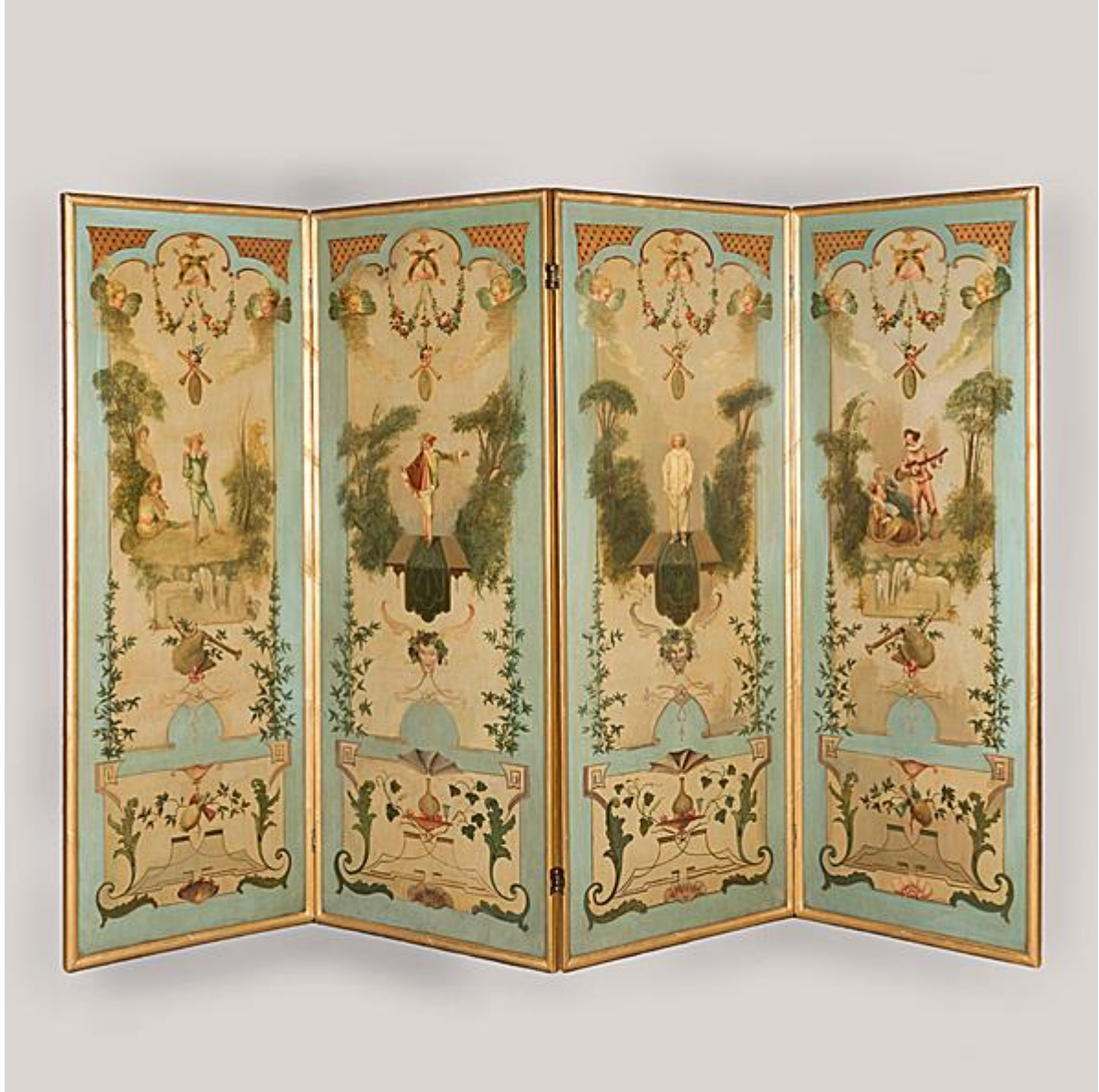
A PAINTED FOUR-FOLD SCREEN IN THE ROCOCO MANNER

XVIII-XIX CENTURY FURNITURE & DECORATIVE ARTS