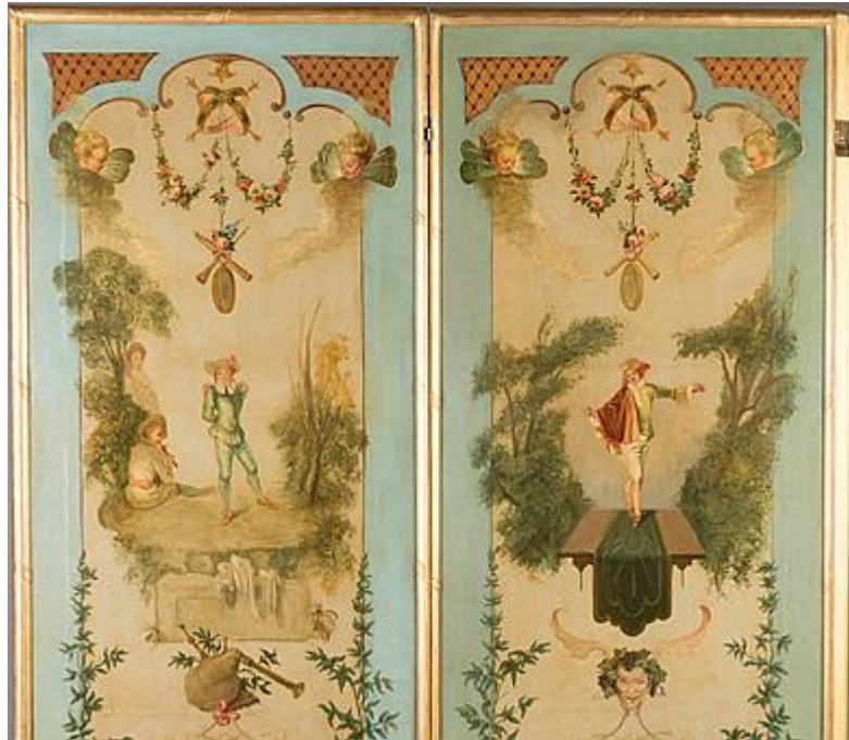
A Painted Four-Fold Screen In the Rococo Manner

XVIII-XIX CENTURY FURNITURE & DECORATIVE ARTS