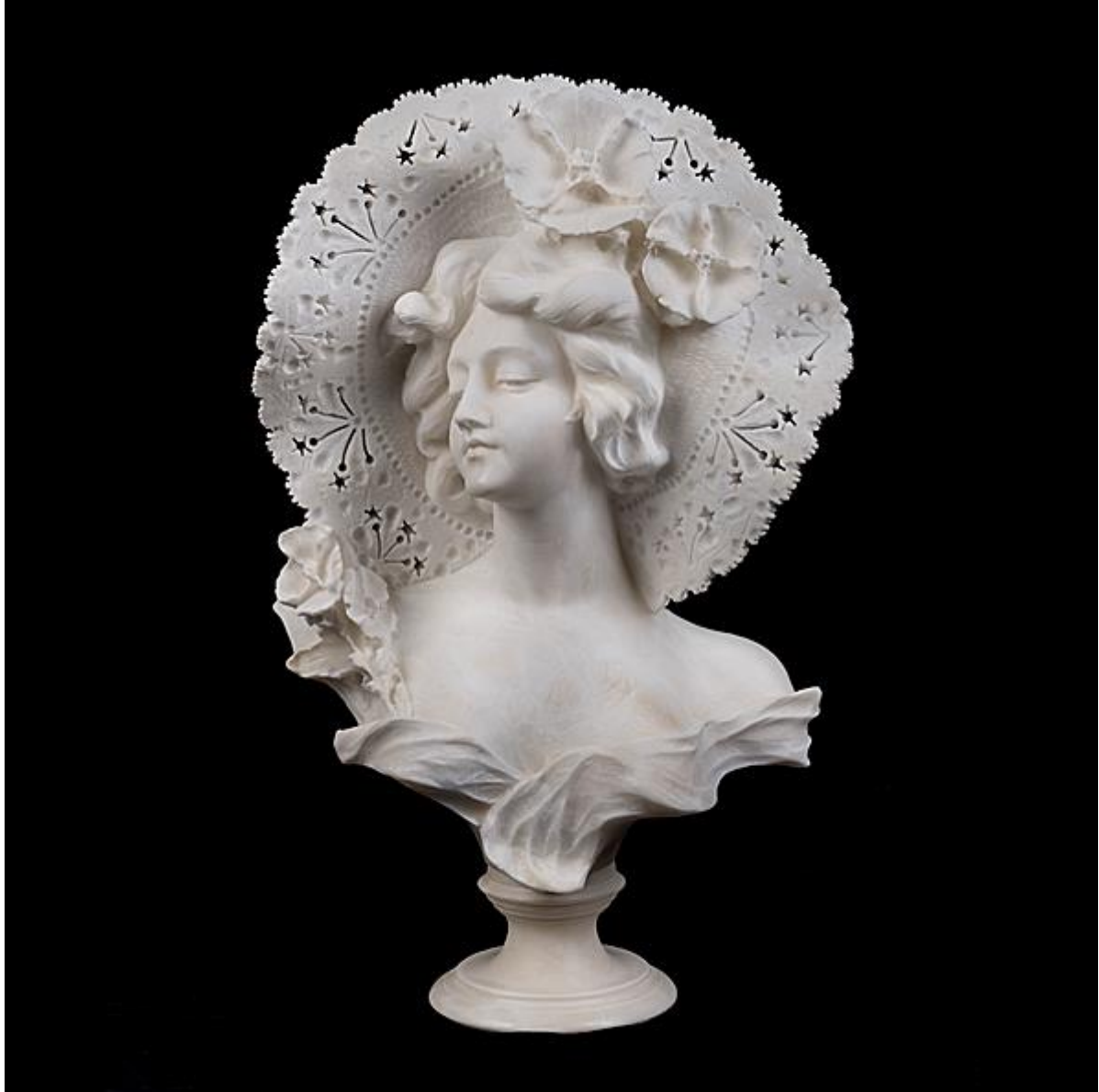
ALABASTER BUST OF AN ELEGANT LADY BY ADOLFO CIPRIANI

XVIII-XIX CENTURY FURNITURE & DECORATIVE ARTS