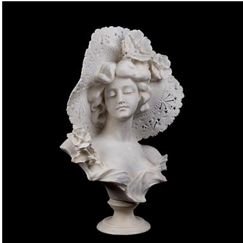
Alabaster Bust of an Elegant Lady By Giovanni Pinotti Cipriani

XVIII-XIX CENTURY FURNITURE & DECORATIVE ARTS