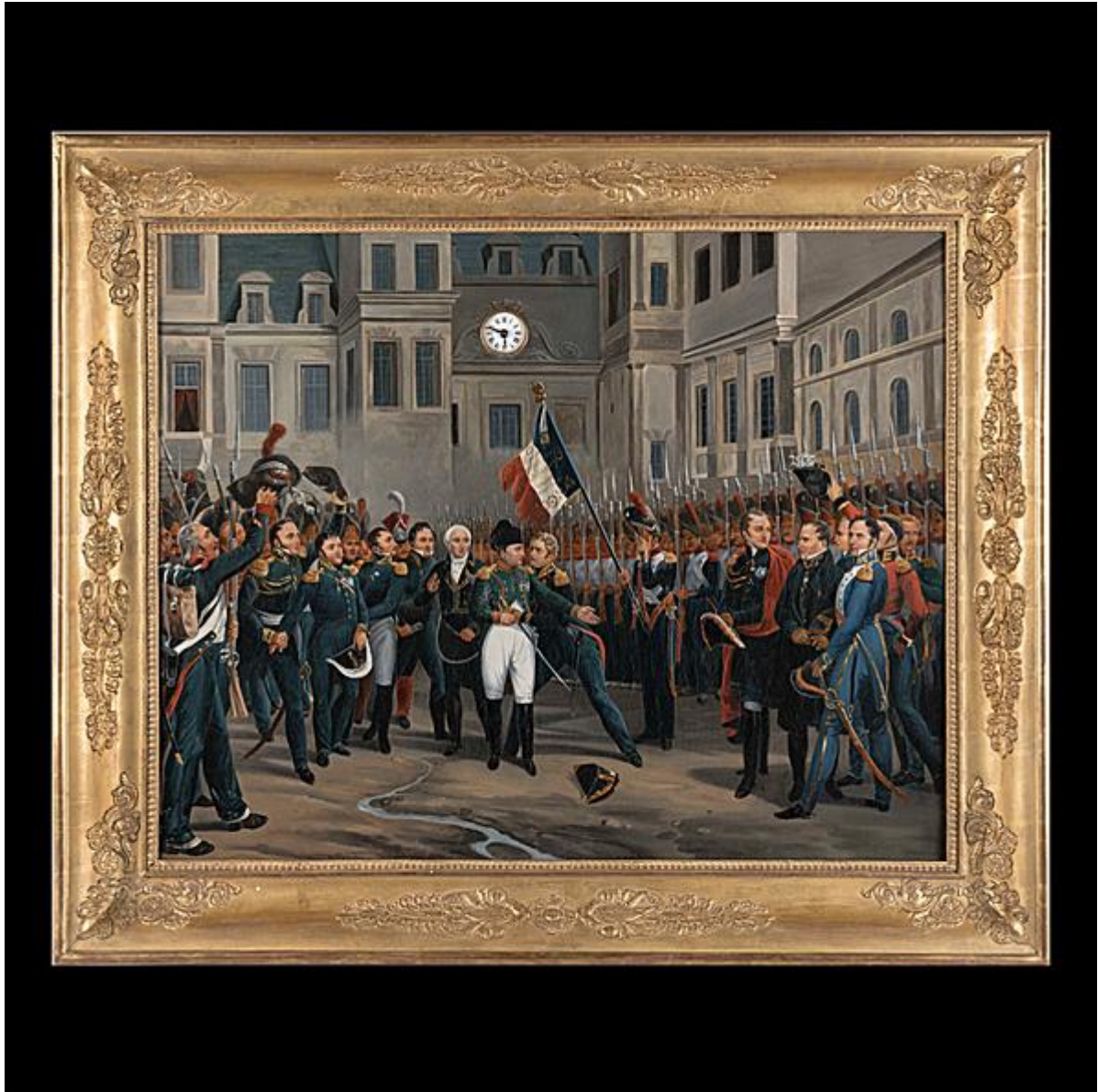
A MUSICAL AUTOMATON CLOCK DEPICTING NAPOLEON AT FONTAINEBLEAU

XVIII-XIX CENTURY FURNITURE & DECORATIVE ARTS