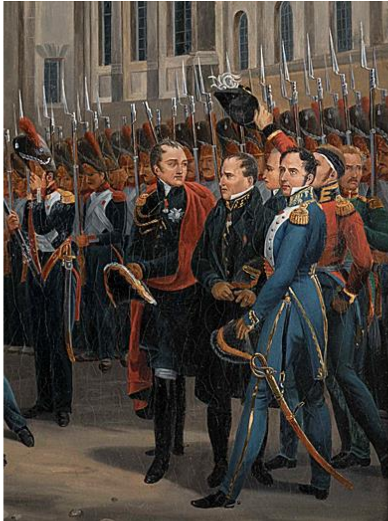
A Musical Automaton Clock Depicting Napoleon at Fontainebleau

XVIII-XIX CENTURY FURNITURE & DECORATIVE ARTS