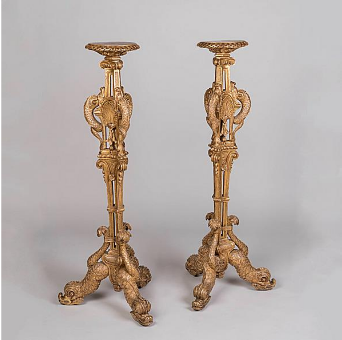
A PAIR OF CARVED GILTWOOD 'TORCHÈRES AUX DAUPHINS'

XVIII-XIX CENTURY FURNITURE & DECORATIVE ARTS