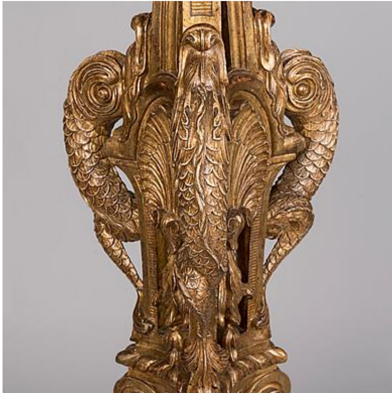
A Pair of Carved Giltwood 'Torchères Aux Dauphins'

XVIII-XIX CENTURY FURNITURE & DECORATIVE ARTS