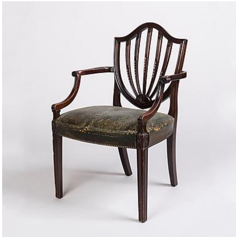
A Set of Twelve George III Style Dining Chairs After the design by George Hepplewhite

XVIII-XIX CENTURY FURNITURE & DECORATIVE ARTS