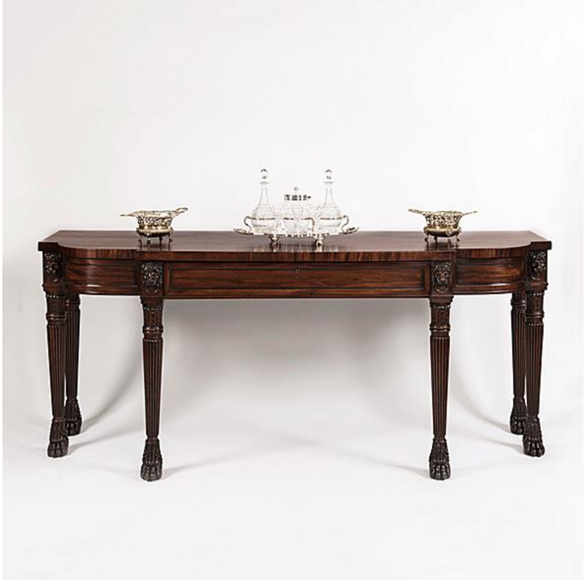
A GOOD REGENCY PERIOD SERVING TABLE IN THE MANNER OF GEORGE SMITH

XVIII-XIX CENTURY FURNITURE & DECORATIVE ARTS