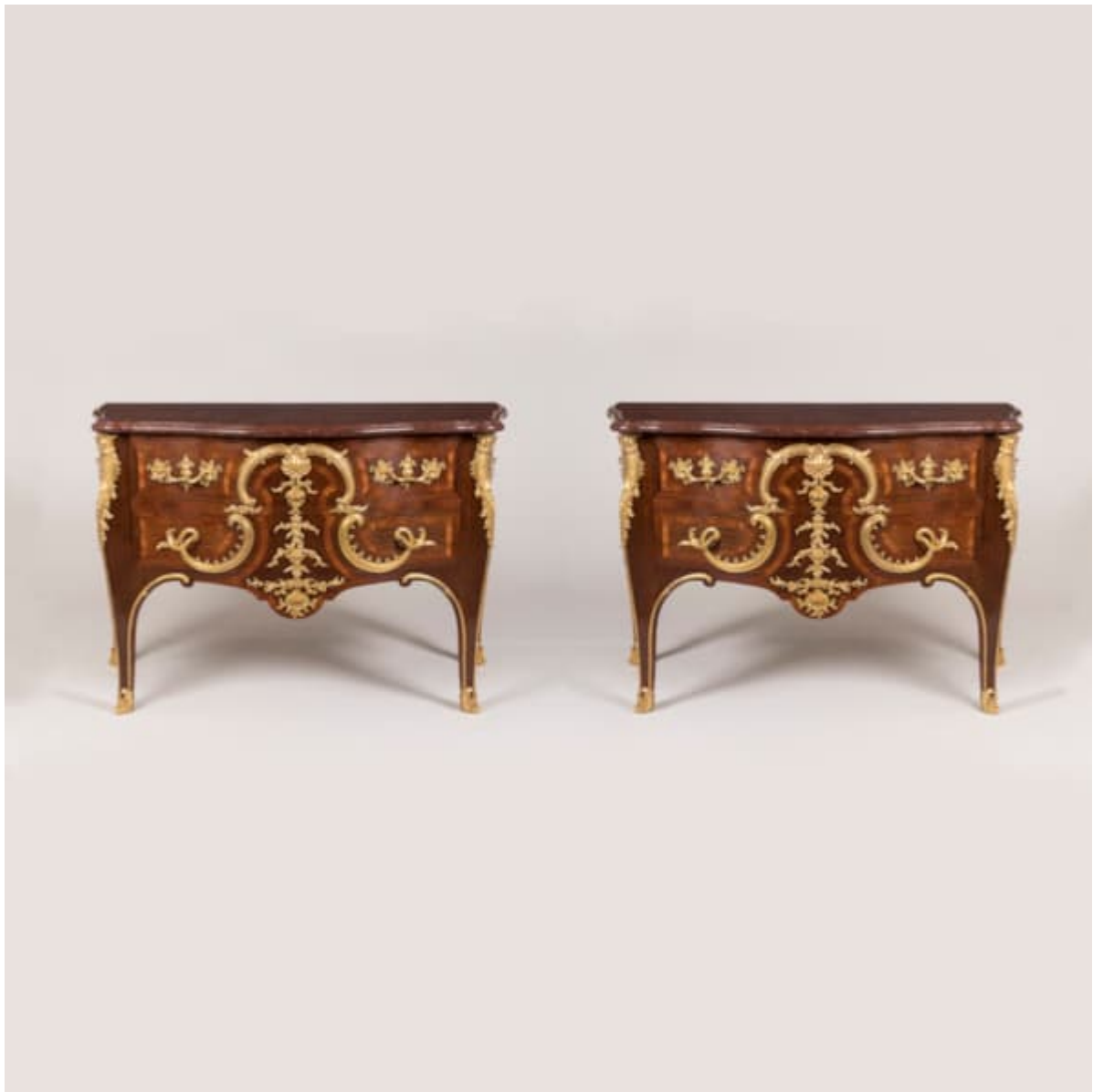
A PAIR OF COMMDES IN THE RÉGENCE MANNER BY GERVAIS DURAND

Dimensions: H: 34.5 in / 87 cm | W: 52 in / 132 cm | D: 24.5 in / 62 cm