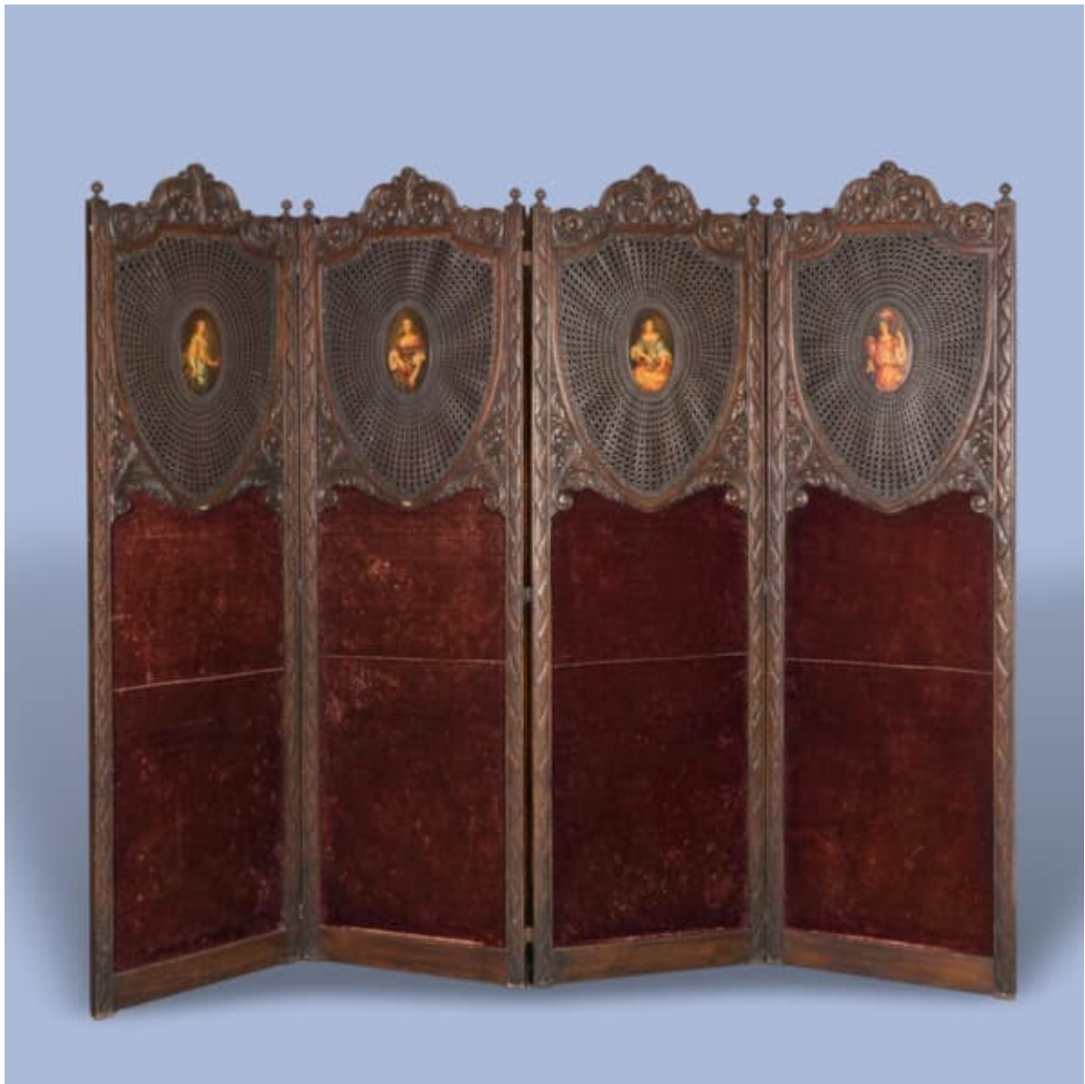
THE 'WINDSOR BEAUTIES' ROOM DIVIDER

Dimensions: H: 77 in / 196 cm | W: 96 in / 244