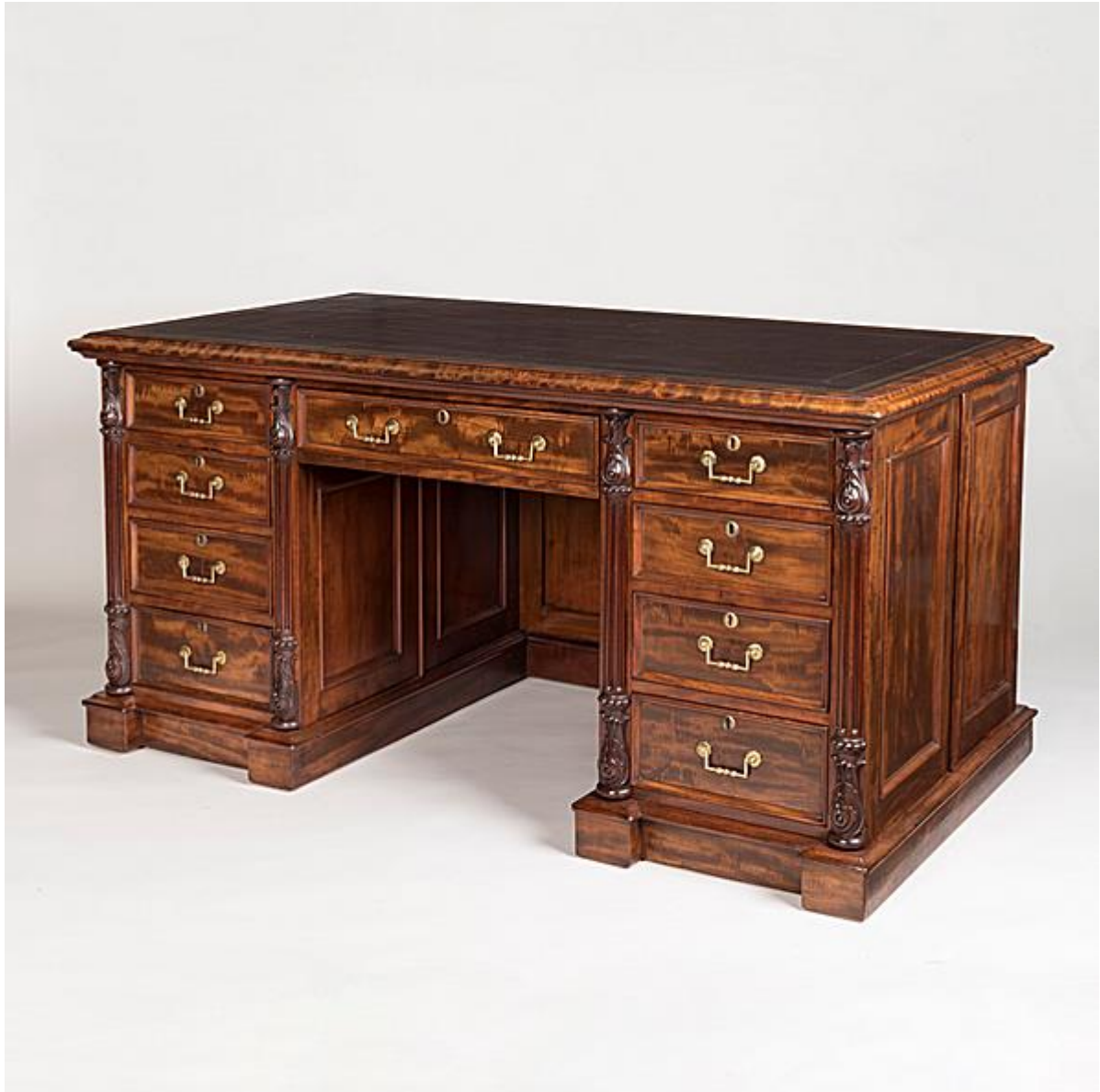
A WILLIAM IV MAHOGANY PEDESTAL DESK

XVIII-XIX CENTURY FURNITURE & DECORATIVE ARTS