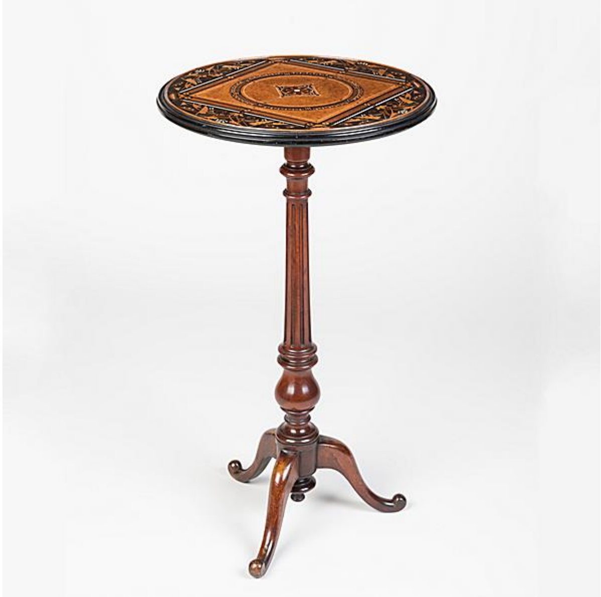
AN UNUSUAL MARQUETRY TOP TABLE ATTRIBUTED TO JACKSON & GRAHAM

XVIII-XIX CENTURY FURNITURE & DECORATIVE ARTS