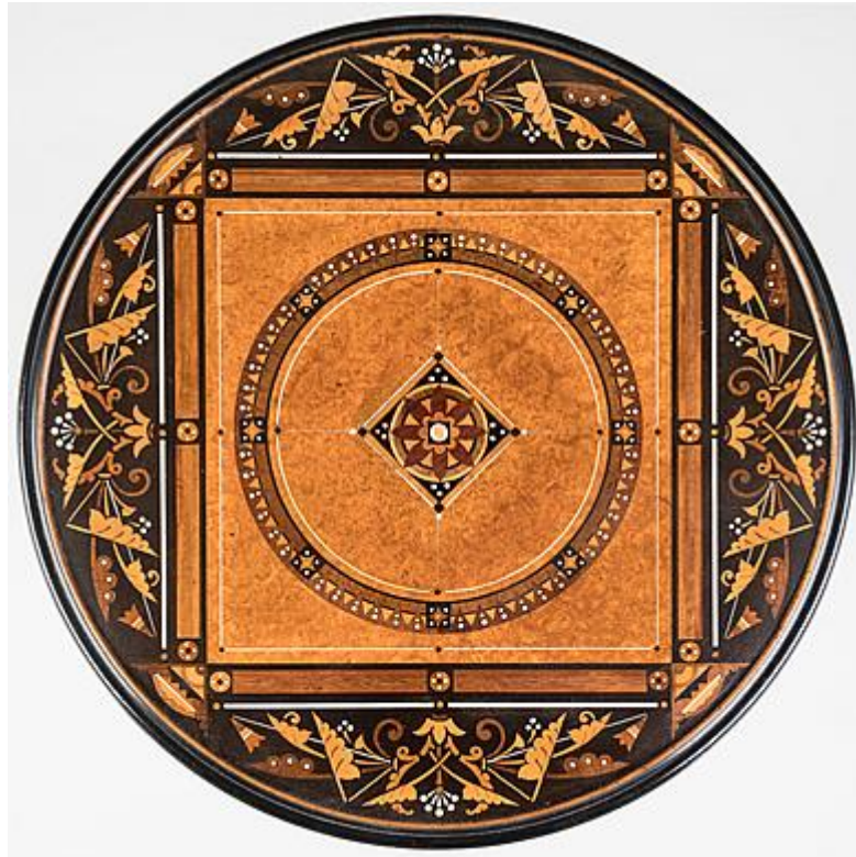
An Unusual Marquetry Top Table Attributed to Jackson & Graham

XVIII-XIX CENTURY FURNITURE & DECORATIVE ARTS