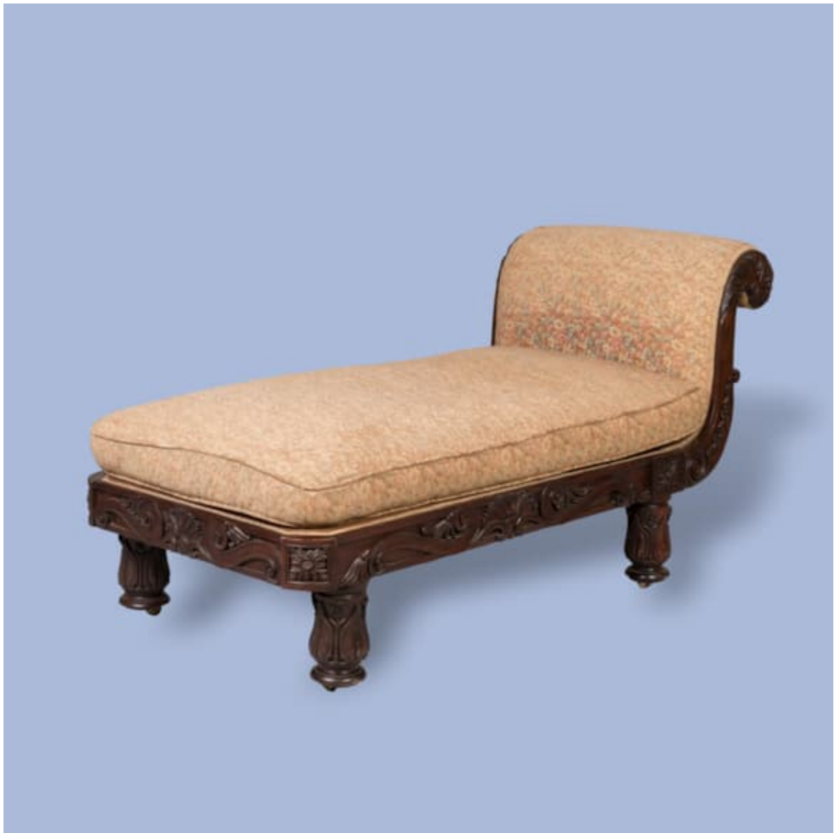
A MAHOGANY WILLIAM IV PERIOD CHAISE LONGUE BY GILLOWS

Dimensions: H: 28 in / 71 cm | W: 54 in / 137 cm | D: 26 in / 66 cm