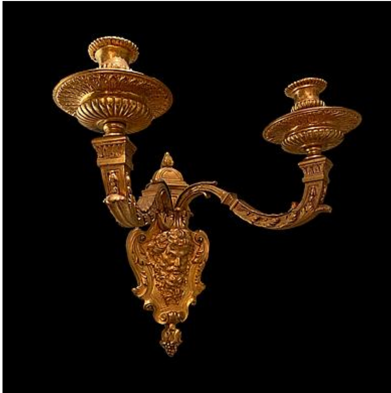
A Pair of Wall Lights in the Manner of André-Charles Boulle

XVIII-XIX CENTURY FURNITURE & DECORATIVE ARTS