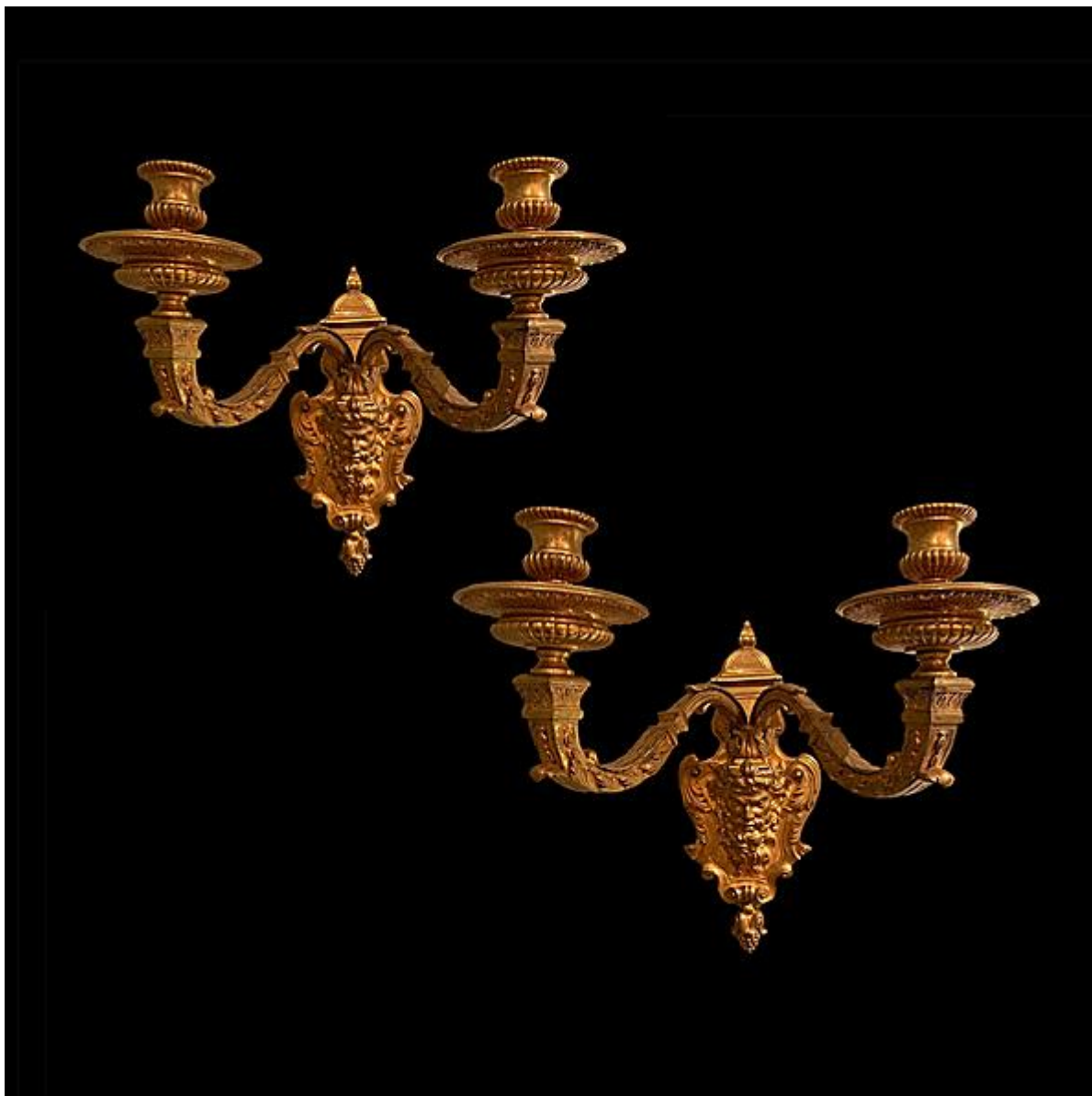
A PAIR OF FRENCH ORMOLU WALL APPLIQUES

XVIII-XIX CENTURY FURNITURE & DECORATIVE ARTS