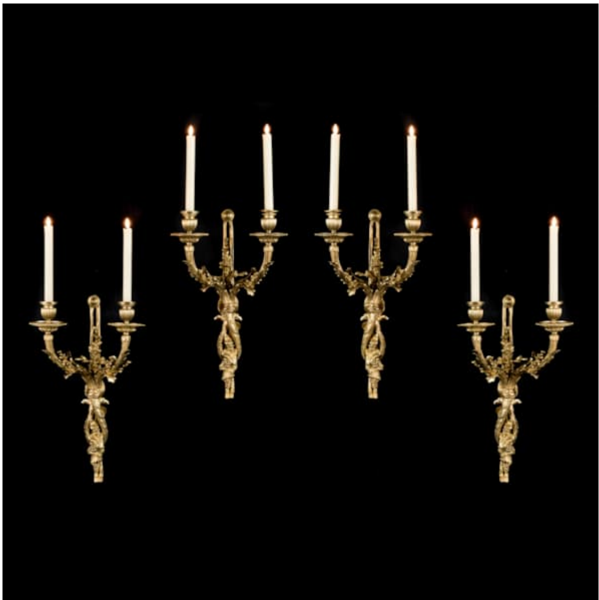
A SET OF FOUR ORMOLU TWIN-LIGHT APPLIQUES IN THE LOUIS XVI STYLE

Dimensions: H: 20.5 in / 52 cm | W: 12 in / 30.5 cm