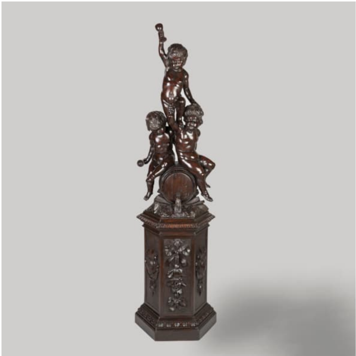
A LARGE VENETIAN SCULPTURE OF THE BACCHANAL BY MICHELANGELO GUGGENHEIM

Dimensions: H: 82 in / 208 cm | W: 19.5 in / 50 cm