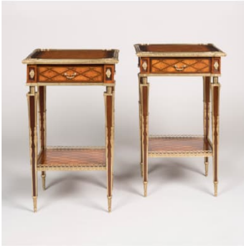
A Rare Pair of Étagères Attributed to Donald Ross

Constructed in Satinwood with tulipwood cross banding, decorated with the typical Donald Ross dotted marquetry trellis work to the upper and lower tiers, having single mahogany lined drawers in the apron, which are fitted with cast loop handles; rising from gilt dressed tapering square section legs shod with foliate bronze sabots, having undertiers inlaid in a conforming manner, dressed with arcaded ormolu galleries.