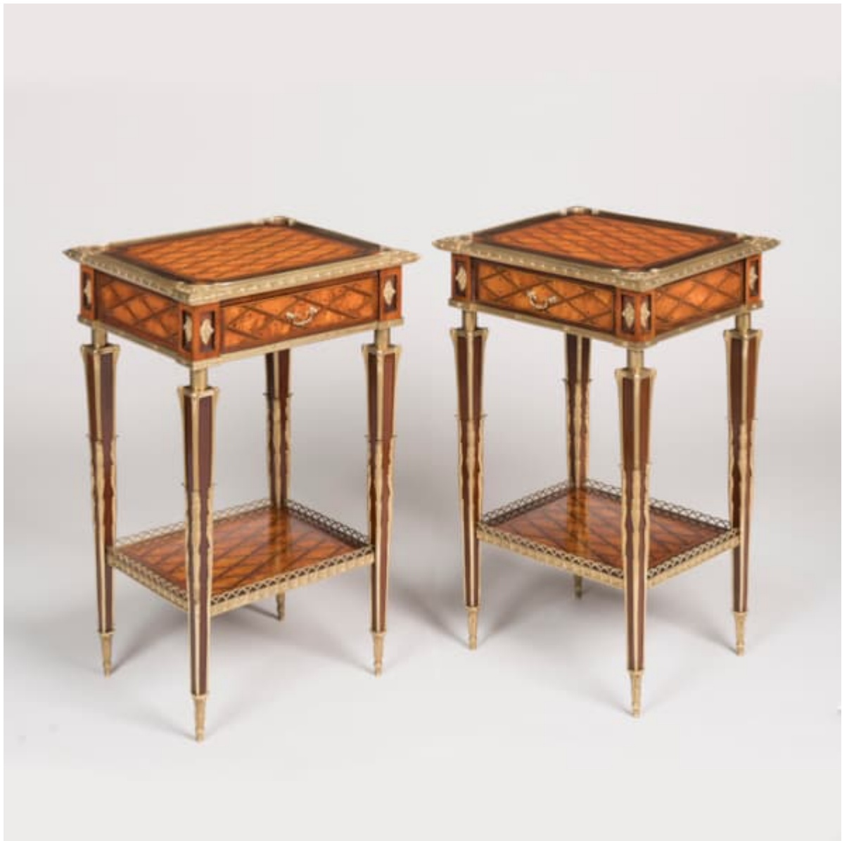
A RARE PAIR OF ÉTAGÈRES ATTRIBUTED TO DONALD ROSS